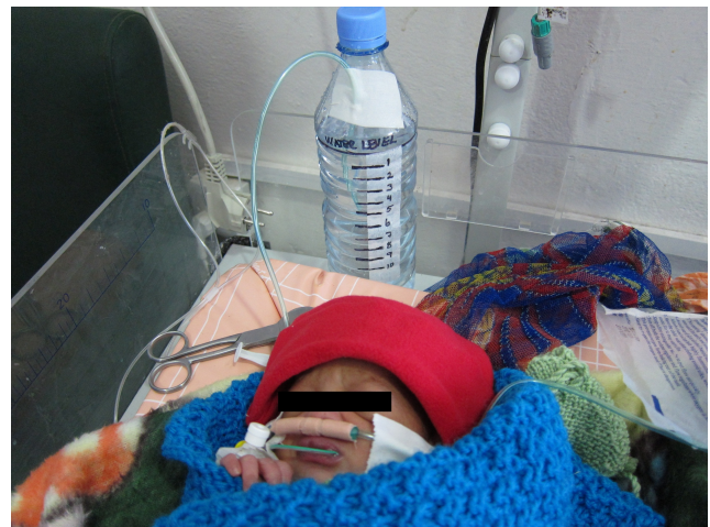
Photo B. A Bubble-CPAP made from a water bottle and modified adult oxygen-prongs. (FV Walmann, 2013)

of regulators had to be changed more often than expected. Battery-powered electrical equipment and backup oxygen cylinders helped us maintain continuous treatment in most situations. Although several up-to-date incubators had been donated to the hospital, challenges with power, cleanliness, and sustainability kept us from using them. The staff gradually learned to calibrate and maintain most of the unit's equipment, but major repairs were still a challenge: We were not able to train local technical maintenance staff.