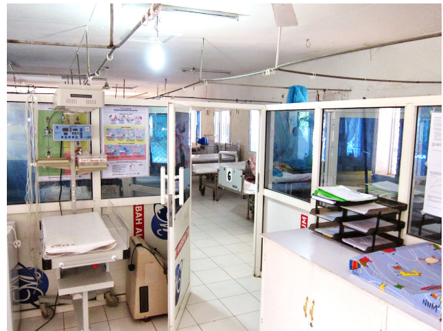
Photo A. Inside the neonatal cubicle, viewing the labour ward through the open door, Hargeisa Group Hospital, 2013. An oxygen concentrator, a resuscitation table, and an examination bench is seen. The Helping Babies Breathe flowcharts on the wall.

Reliable electric power was a continuous challenge. Under-dimensioned electrical wiring and regular power-cuts put heaters, monitoring devices, and oxygen concentrators out of service. Infrared bulbs, extension cables, and fuses