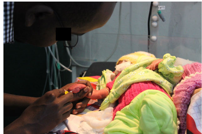
Photo E. A health worker in training is placing a cannula intravenously. (FV Walmann, 2013)

Coordinative meetings between the NSCU and the ma-