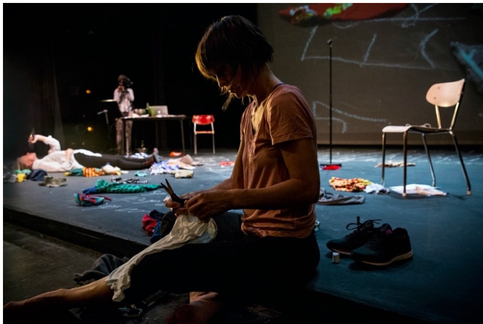
Figures 4 and 5. Childism (2015).

Sometimes it could be difficult to confront the topic of the performance. In order to give the audience a chance to escape and listen with another kind of attention, they were all given a little sewing kit at the beginning of the performance. The kit contained some pieces of fabric, yarn, some colourful plastic pearls, needles and thread. Many members of the audience chose to sometimes sew. The three performers on stage also sewed. In one section of the performance music was played while we silently sewed. This is also an old ritual and activity for women worldwide, in all cultures, where stories, often of abuse, have been shared while