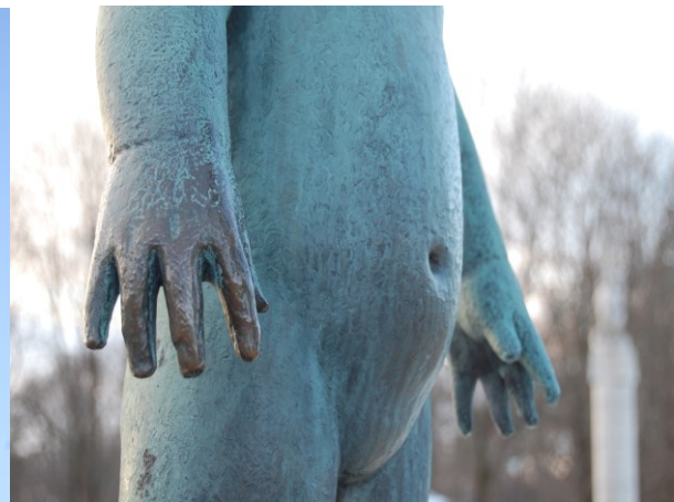
Figures 8 and 9. Sculptures at Vigeland Park, Oslo (2018).