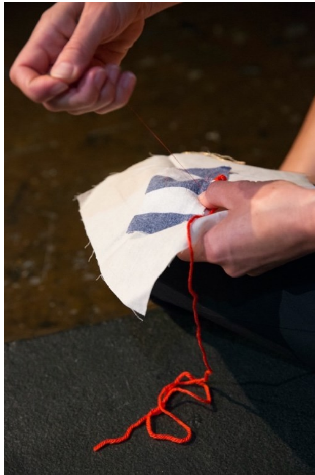
Figure 6. From the performance Childism (2015).

sewing, embroidering or knitting. In the performance, this became an activity without words, a pause to digest, reflect and sense what was not being said – the absent presences.