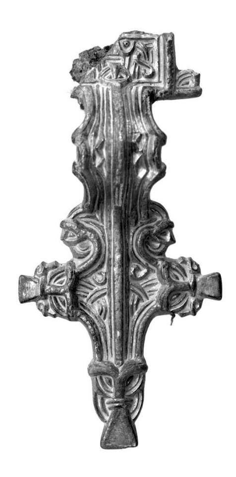
Brooch 17: The Nornes brooch.

The brooch is made from gilded silver. It has a rectangular headplate and a bow that flares slightly to the side at its apex. Most of the footplate is missing, but based on similarities with other brooches of a similar design, it is reasonable to guess that it would have been rhombically shaped with lobes protruding from the left side and the end of the footplate. The right lobe is still visible. The headplate has an inner panel, bordered to the outer panel by a niello border. The decorations of the entire brooch appear to be interwoven style 1 decorations. In the inner panel of the headplate, two faces are visible, one in each bottom corner. The decoration on the bow seems to be indented line decoration. There is a ridge running across the bow. This ridge, and the borders of the bow, seem to be made of niello. The connection between the bow and the footplate is flanked by two zoomorphic decorations.