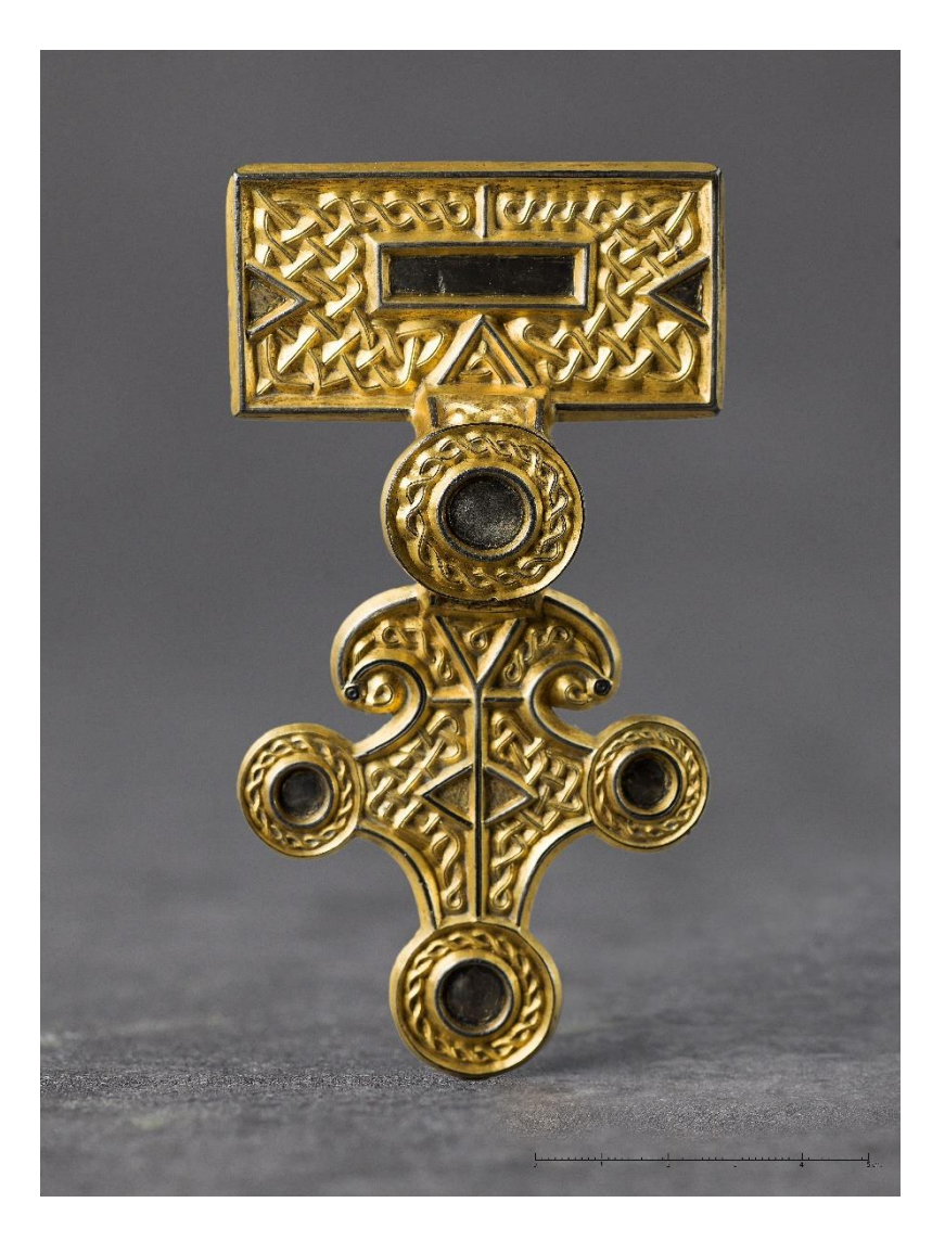
Brooch 14: The Jorenkjøl brooch. Photography by Annette Øvrelid