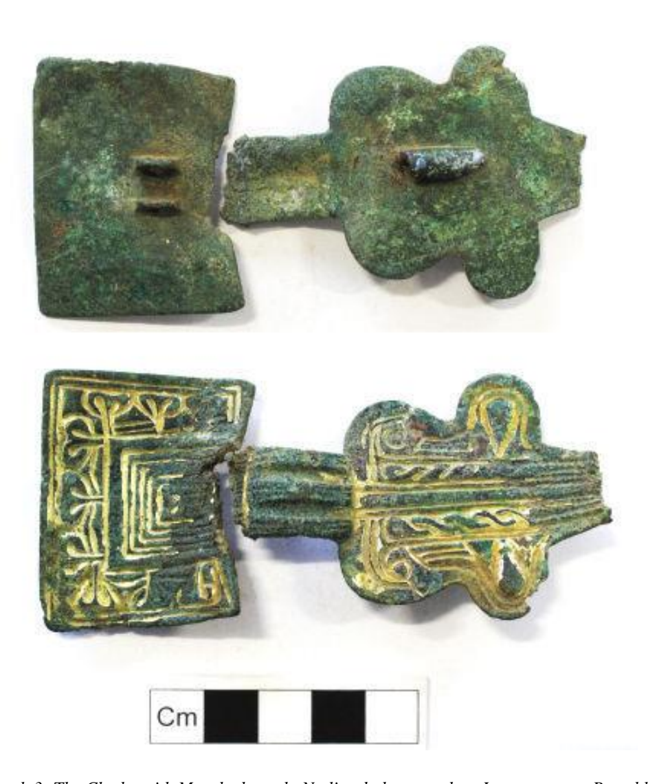
{\it Brooch 3: The \ Claxby \ with \ Moorby \ brooch. \ No \ listed \ photographer. \ Image \ source: Portable \ Antiquities \ Scheme}

borders of the footplate have two flanking zoomorphic figures, vaguely reminiscent of two birds. Flanking the spine that runs down the footplate are two triangles, with two smaller indented triangles inside them. Along the short sides of these triangles are another decoraive weaving band. The lobes, as well as the corners of the headplate, are covered in silver sheeting (Green & Rogerson, 1978, p. 41).