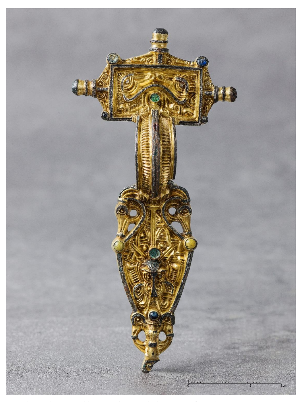
Brooch 12: The Friestad brooch.