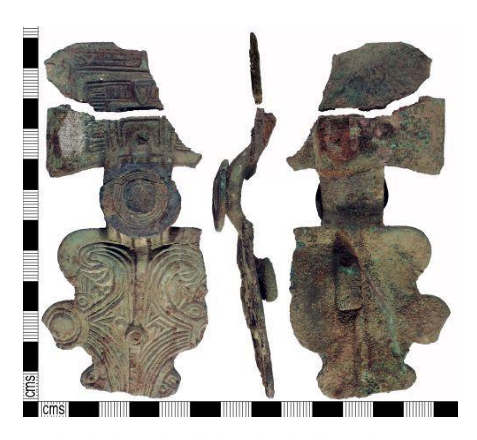
Brooch 5: The Eldmire with Crakehill brooch.

of the bow. The inner panel has a series of line based ornamentation likely made with a negative mold as they are protrusions rather than the usual line indentation. They surround two rectangular boxes, with the bottom box having the vague form of the upper part of a face. The bow is unadorned, apart from a central spine running along its length, and the insertion of red stone or glass on the apex. The footplate is more intricately decorated in typical style 1. A central ridge begins roughly in the middle of the footplate. Another upper part of a face is visible where this ridge ends. The lobes of this brooch are not perfectly circular; they more so form elongated extensions from the brooch itself, and all three are inset with teardrop shaped green/blue glass or stone insertions. These are surrounded by lines that aid in forming the teardrop shape. A similarly intricate linear pattern decorates the centre of the footplate. On the uppermost borders of the footplate, flanking the join with the bow, are once again two zoomorphic decorations; however, these are less easily identifiable than the customary bird-like decoration.