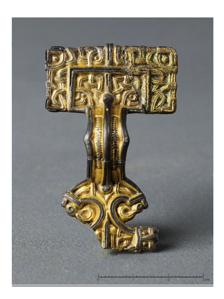
Brooch 16: The Nord-Braut brooch.

A silver brooch with a rectangular headplate and a rhombic footplate with three lobes. The headplates' inner panel has style 1 art with at least two creatures. The outer panels are divided into three sections by concentrical square shapes in the upper corners. Each of the three outer panels also have style 1 art. The bow has at least two faces; one by the headplate and one by the footplate. At the bow's apex there is a disc with concentric circles in the middle, surrounded by wave like decorations. Flanking the join of the footplate and the headplate are two zoomorphic creatures. The footplate has more style 1 decorations, with each of the three lobes being shaped like faces; the two on the left and right flanks being identical, with the terminal lobe being slightly larger and with a larger mouthpiece.