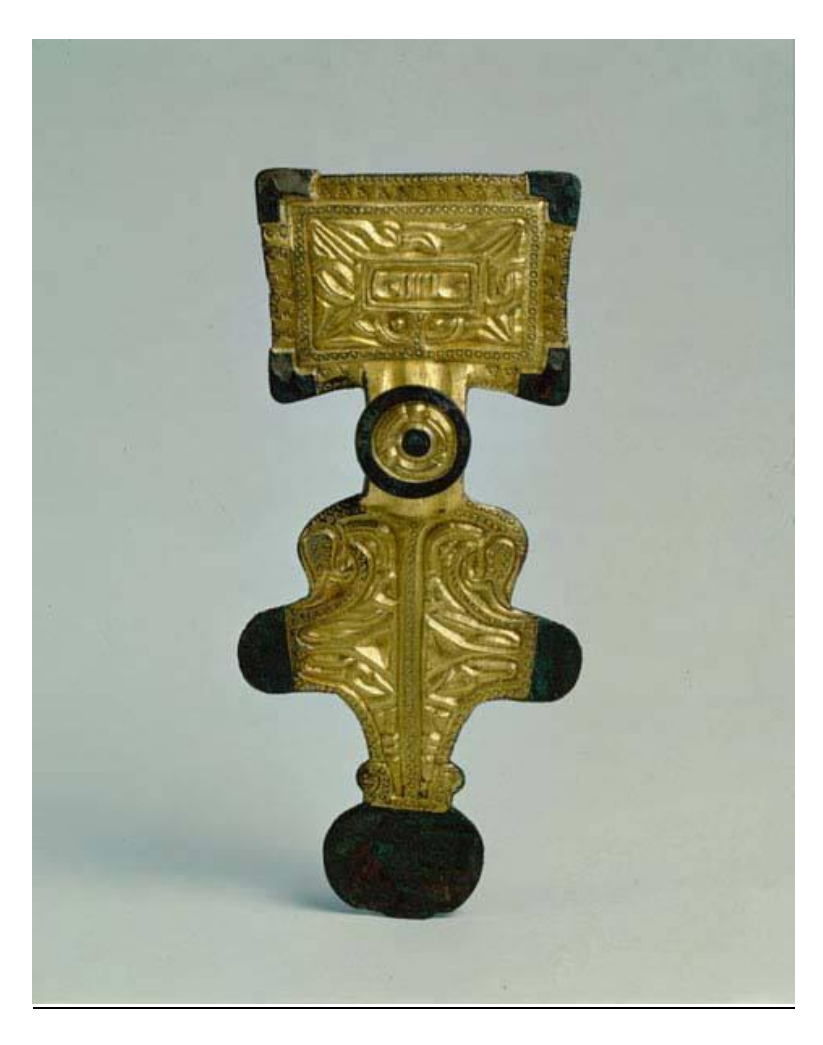
Brooch 9: The Mildenhall brooch.

A gilded brooch with bichrome decoration. The headplate has a square inner panel with weaving patterns along the edges, and two central boxes showing four leaves each in contrast. The outer edges of the headplate swell towards the corners, creating a not quite perfectly rectangular head. The outer panel has gold and niello zigzag patterns. The bow is straight with a ridge along the centre, with niello decorations on the central ridge and on the border ridges of the bow. The footplate is rhombical, with zoomorphic flanking figures where the bow meets the footplate. The footplate has a ridge running down the centre, with two triangles placed next to it. Their points are angled towards the sidelobes, creating a stronger impression of a rhombical shape. The decoration on the footplate depicts a weaving pattern between the edge of the footplate and the triangles. The lobes are curved, with the terminal lobe being roughly circular and the sidelobes being semi-circles. All three are covered in silver sheeting.