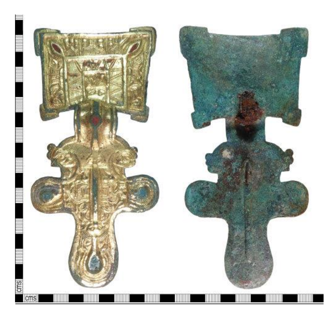
Brooch 4: The Cold Brayfield brooch.

flourished repeating T shapes. There is a midline on the bow, which vaguely continues down the footplate. There is a vague indication of a birdhead or another zoomorphic creature flanking the join between bow and footplate. The side lobes have a tear drop shape, and the midline of the footplate is flanked by spiralling interlace patterns.