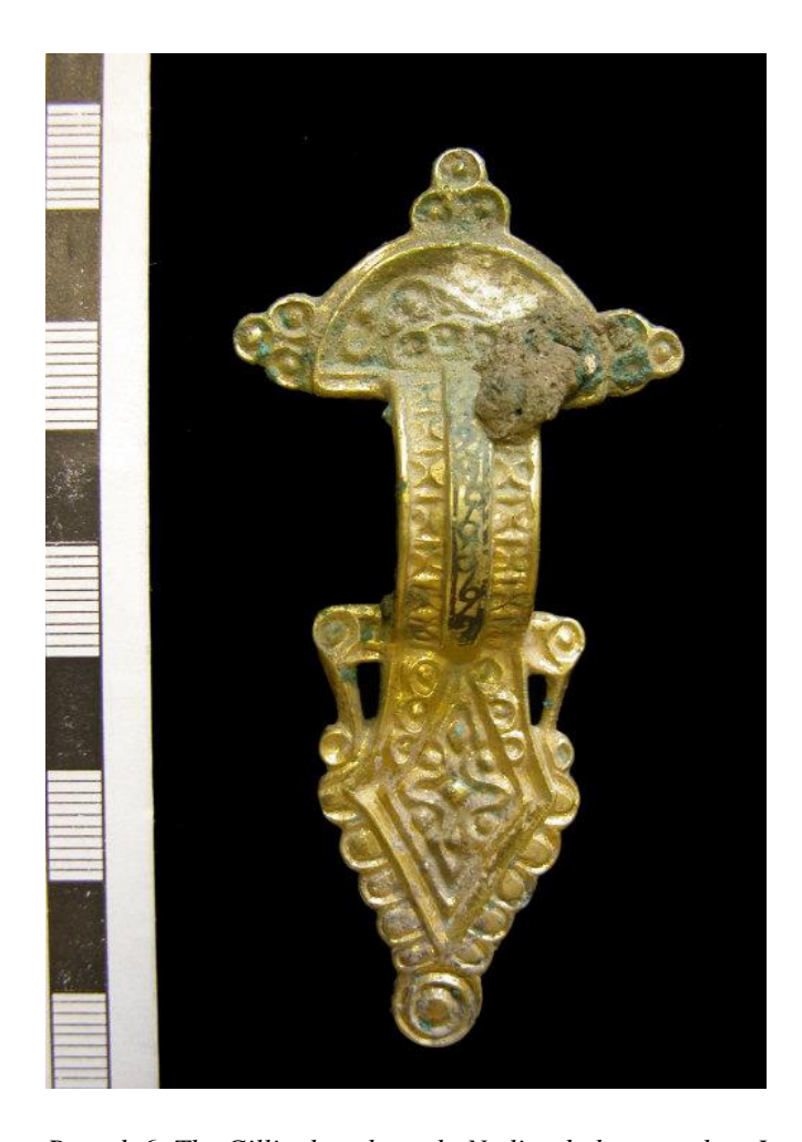
Brooch 6: The Gillingham brooch.

The brooch is fragmented in two pieces, though a quarter of the headplate is missing and parts of the footplates' right and bottom lobes. Gilding is only faintly visible, as is the presence of tin or silver coating on parts of it. The majority of the brooch is in a single piece, with the second piece being roughly a third of the headplate. The headplate shows an inner panel with concentric rectangular borders, surrounded by an outer panel with faint impressions that are hard to discern. Fascinatingly, the bow has a central disc on it. Discs of this variety are not uncommon in Norwegian material, but they do not occur in England, except for the Kentish variety of great square headed brooches. The footplate has loose zoomorphic elements to it, likely late style 1.