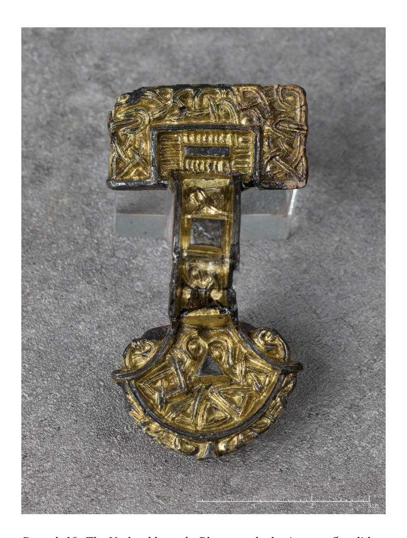
Brooch 19: The Vatland brooch.