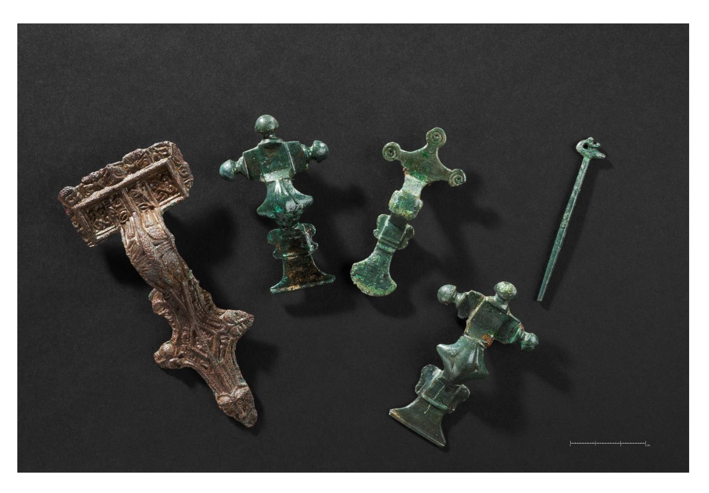
Brooch 13: The Holmen brooch (the leftmost of the four brooches depicted.