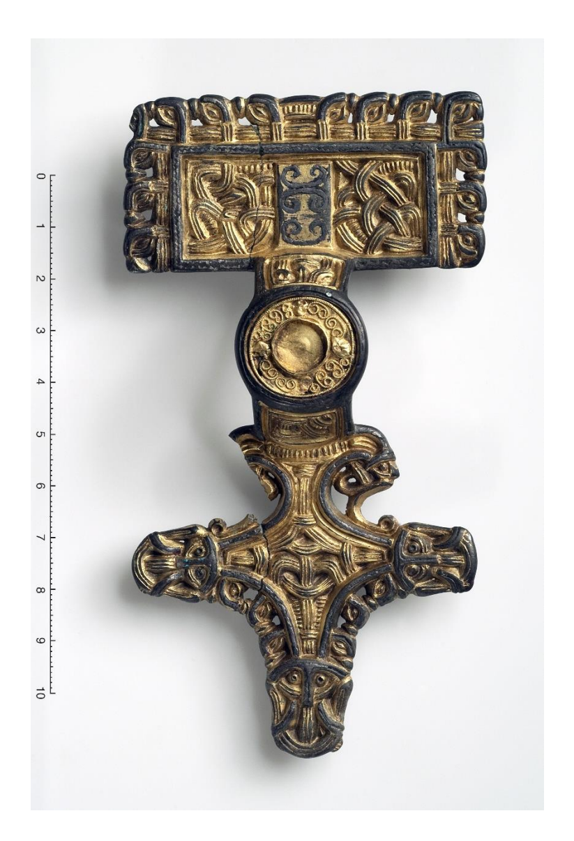
Brooch 11: The Arne brooch.