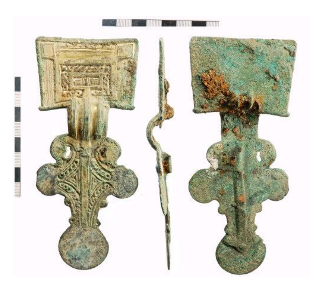
Brooch 10: The Thoresway brooch.

The brooch has a rectangular headplate and a rhombic footplate with three lobes. The brooch is made of gilded bronze. The corners of the headplate, the ring around the disc on the apex of the bow, and the lobes of the footplate are all bichrome. The headplate has an outer and inner panel, with the inner panel having two eyes below a central rectangular section. The decoration on the rest of the headplate inner panel is style 1 in the form of flowing lines. The outer panels are decorated with dot indentations. The bow has two grooves running along it, with a disc on the apex. The disc has a centre and border that are not gilded. The join between the footplate and the bow has two zoomorphic figures flanking it. The footplate is rhombic in shape and bisected down the middle by a slight ridge. Two triangles are flanking the centre of the ridge, creating the core of the rhombic shape. The lobes are circular or semi-circular, and unadorned and ungilded.