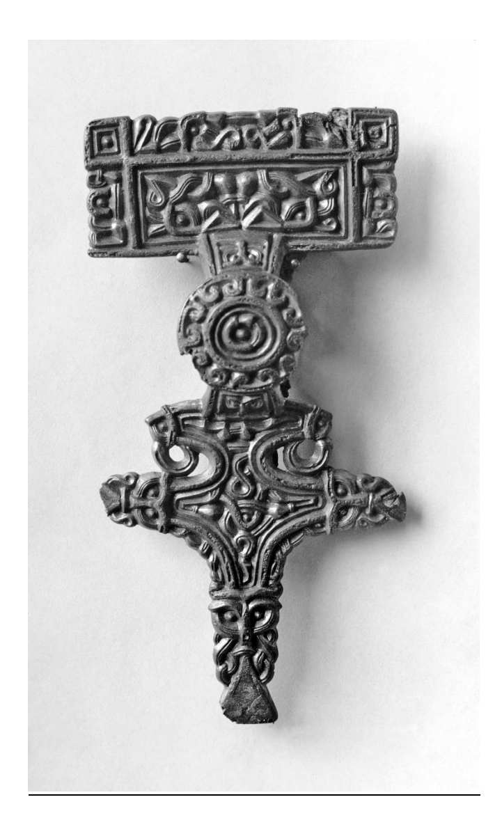
Brooch 15: The Kvåle brooch.

in the shape of a V with a straight line beneath it. The centre of the footplate has two flanking triangles with points towards the left and right lobes. The decoration depicts interwoven bands, and forms the repeating pattern on the entire brooch; from the headplate to the circle on the disc, to the footplate and the rings on the lobes. Even the zoomorphic protrusions from the join between the bow and the footplate are decorated with interwoven patterning, and little else. A small curl at the very edge of this decoration indicates a beak, and a more prominent inlay of niello indicates eyes. This brooch has been judged to be bordering between style 1 and 2 (Sjøvold, 1993, p. 24; Kristoffersen in personal communication at the archaeological museum in Stavanger, 5<sup>th</sup> of October 2021).