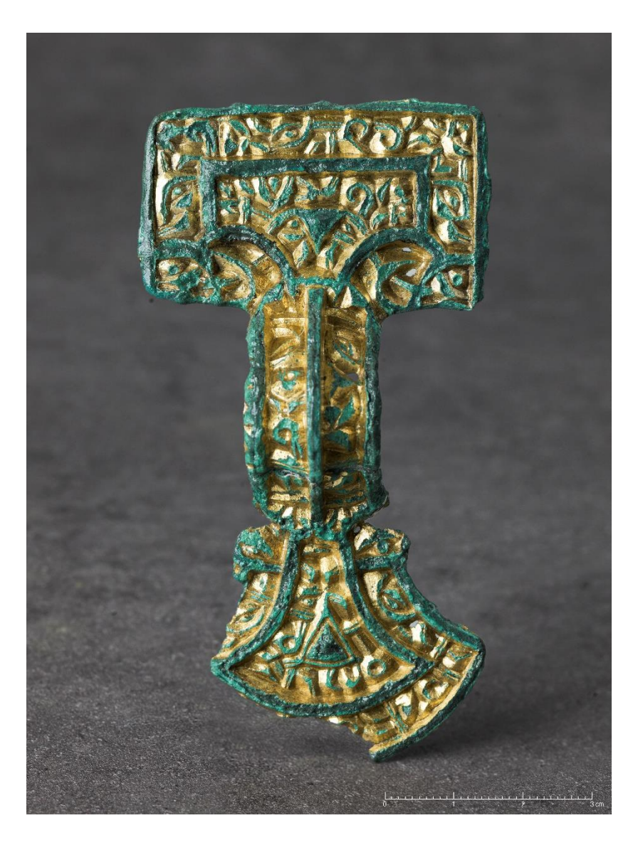
Brooch 18: The Torland brooch.