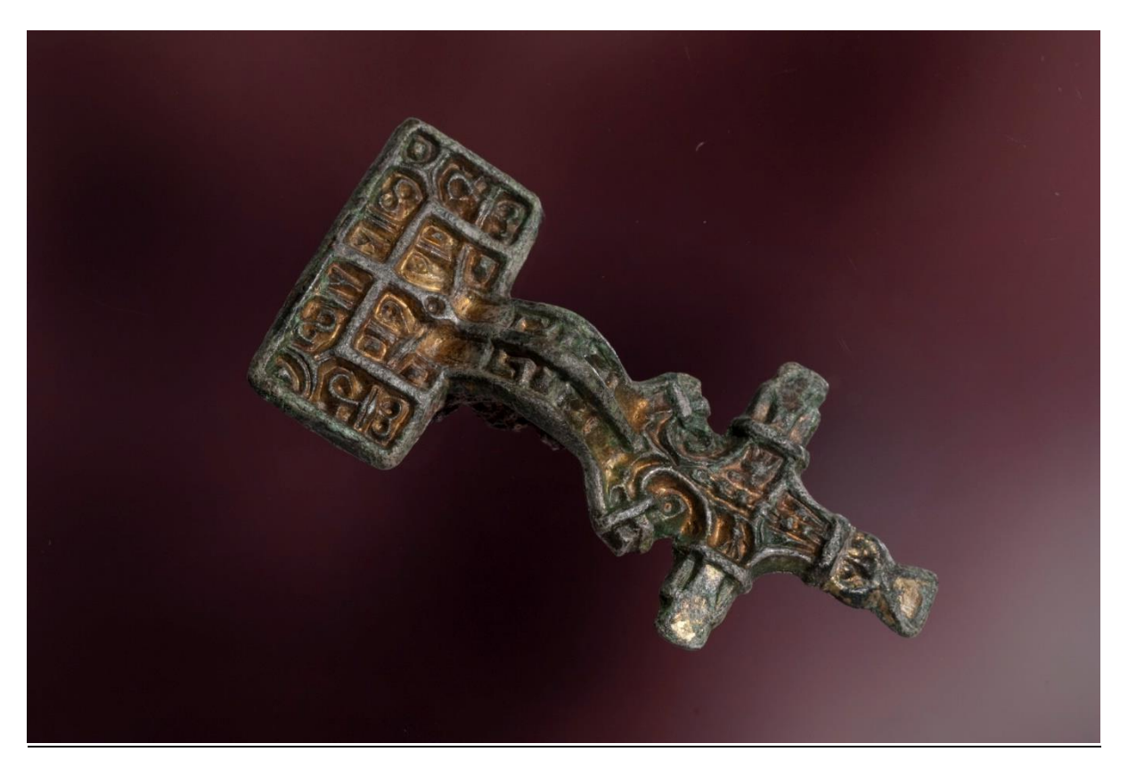
Brooch 20: The Vaula brooch.

has a small outer panel, separated from the inner panel with a border of niello. The decoration here as well appears to be interwoven style 1 decoration.