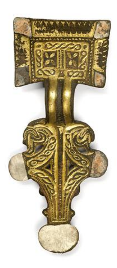
Brooch 8: The Ipswich 16b brooch.

A very ornate and large brooch. At the core it has a square headplate, a bow, and a rhombic footplate. The outer borders of the headplate flare out at the top corners. The side lobes of the footplate are square rather than rounded, giving the brooch a blocky appearance. Given the silvered plaques on the lobes, the brooch can be considered bichrome. It is decorated with style 1 decoration. Faces are visible on the outer panel of the headplate, one on each side, and another by the lower lobe of the footplate. There are remnants of red enamel inlays on the headplate, bow, and footplate. There are trace signs of repair work on the bow, from before the piece was rediscovered.