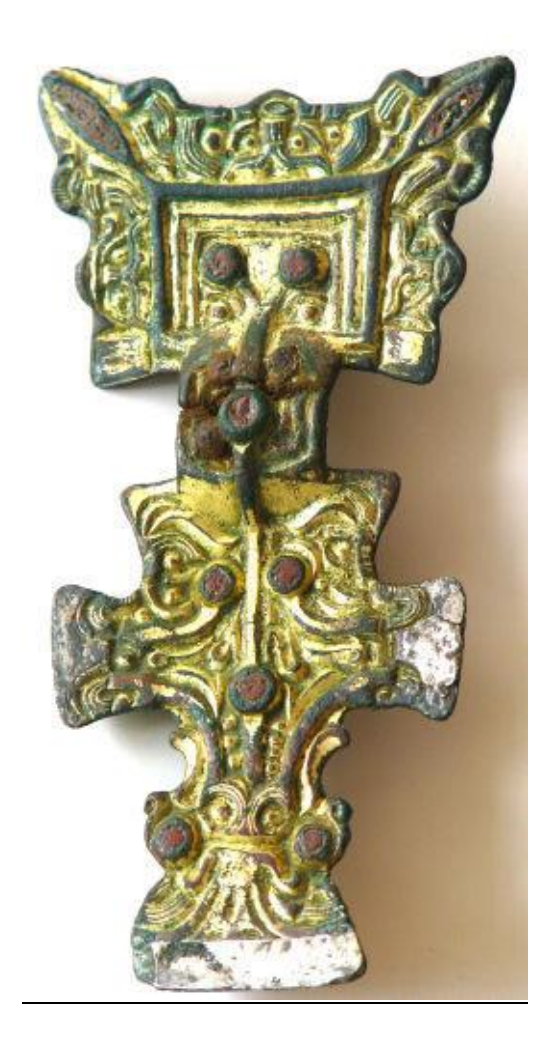
Brooch 7: The Harston brooch.

Highly reminiscent of a common relief brooch design from Scandinavia, the headplate has a shovel shape (semi circle), with a straight bow and a rhombic footplate. The headplate has three protruding lobes, made from three smaller indented circles each. The inner panel of the headplate has a curvilinear decoration. The bow has indentations shaped vaguely like x's. The footplate has an outer panel and an inner one; the outer panel has a series of semi-circles running around the lower two sides of the footplate, meeting at a lobe on the bottom. This lobe is shaped like a circle with an indentation pattern. On the uppermost part of the footplate, protruding on each side, there are the rudimentary bird decorations that we have seen before. The brooch is gilded and relatively untarnished. This brooch falls outside the standard selection of brooches from England as it is not a square headed brooch. However, it may be a perfect example of the sort of influences that aided in the creation of the great square headed brooch. I will discuss more about this in the analysis.