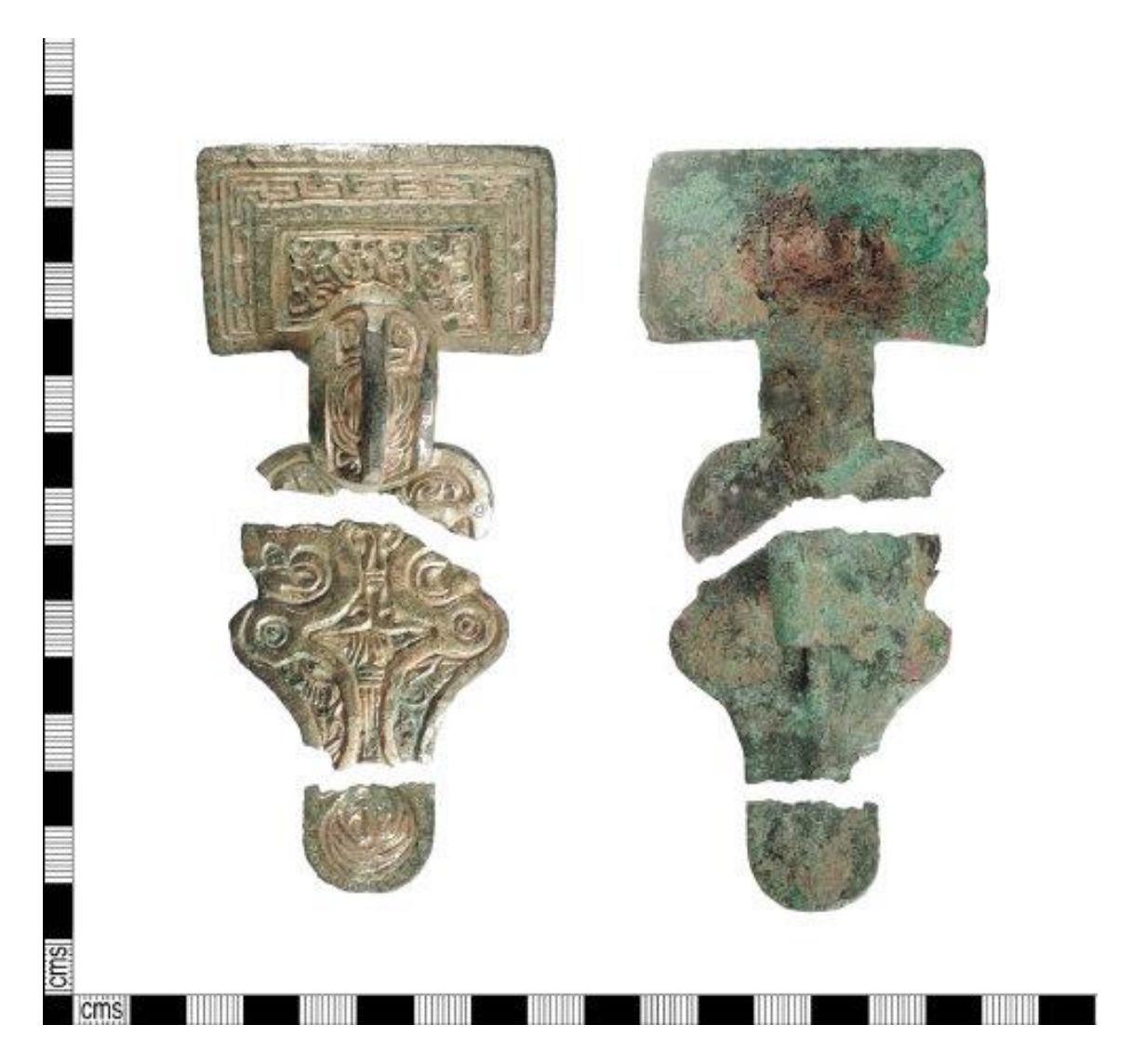
Brooch 1: The Alford Area brooch.