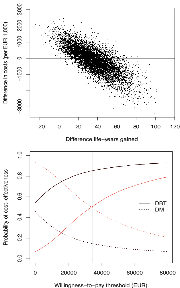
Fig. 2 Results of 10,000 simulations plotted in the cost-effectiveness plane per 100,000 females invited to screening (top). Cost-effectiveness acceptability curves based on the simulations (bottom). Black curves show the result for an additional cost of DBT of €8.10 estimated from To-Be, red curves show the result for an additional cost of DBT of €32, the maximum additional cost for cost effectiveness at a WTP of €35,000