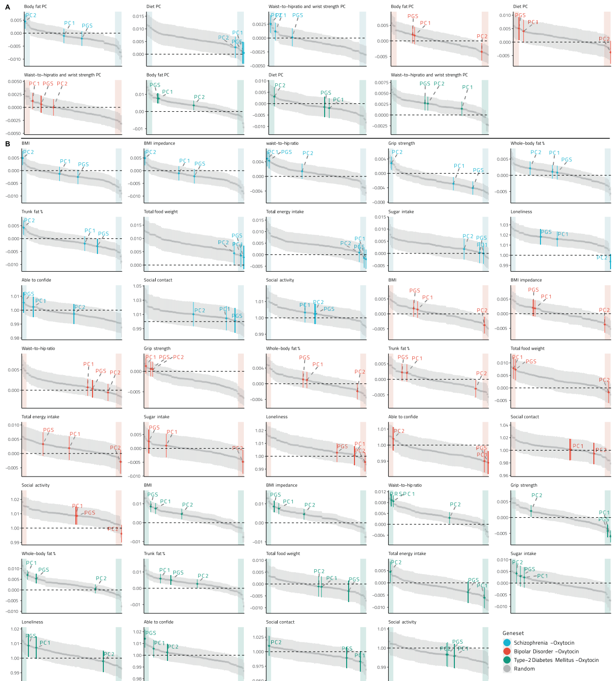
Fig. 2 Distribution plots of the effect sizes of the PGS oxT and PC-PGS oxT models and models from PGSs calculated from 100 random gene sets of equal size for cluster principal components and individual variables. A, B We found that a number of the statistically significant effects are specific to the oxytocin pathway and not due to the random association of the SNP in the gene set with the chosen phenotypes: schizophrenia, bipolar disorder, and type-2 diabetes mellitus. PGS polygenic score, PC1 first PGS principal component, PC2 second PGS principal component.

variables, only total sugar intake was significantly negatively associated with BD PC2 oxT ( p_{\text{fdr}}<0.001 ) but not BD PGS oxT or BD PC1 oxT (both p_{\text{fdr}}>0.05 ), with an effect size at the lower 5% of the distribution of random gene-set PGS models. The model showed significant positive interaction effects between BD PC2 oxT and the other two variables in the dietary cluster (Supplementary Table 11). Food weight was significantly positively associated with BD PC1 oxT and BD PGS oxT ( p_{\text{fdr}}<0.001 ), with effect sizes in the top 5% of the random PGS model distribution, and with significant negative