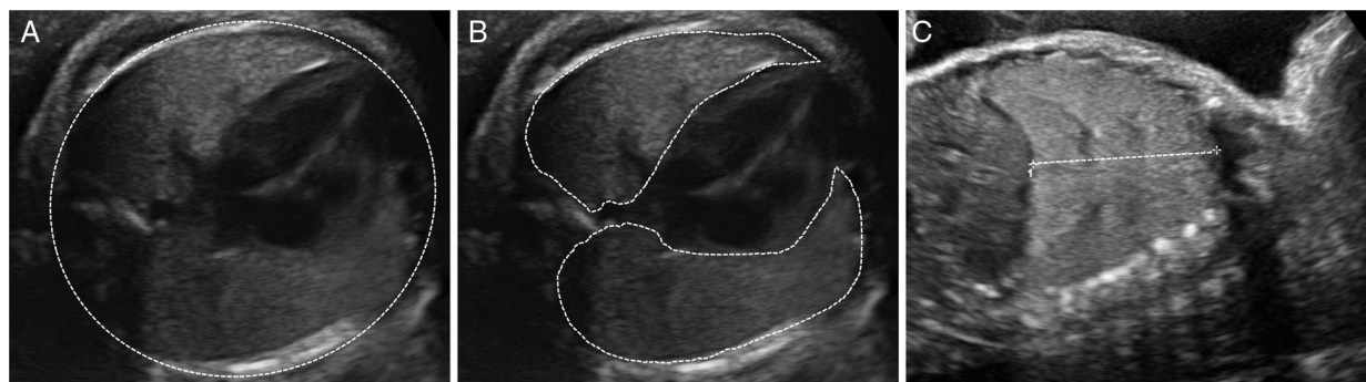
Figure 1. Ultrasound images demonstrating the measurement of the thoracic circumference (A), lung area (B), and lung length (C). Lung volume was calculated from lung area and lung length.

Baseline characteristics for the 447 subjects are given in Table 1. Except for a higher educational level, the women included in this study did not differ from the total PreventADALL study group (Table 1). Nicotine use during pregnancy was low; of the 56 users, 54 stopped when recognizing their pregnancy. The mean GA at ultrasound examination was 30.0 weeks (SD 0.50), ranging from 28.9 to 31.3 weeks.