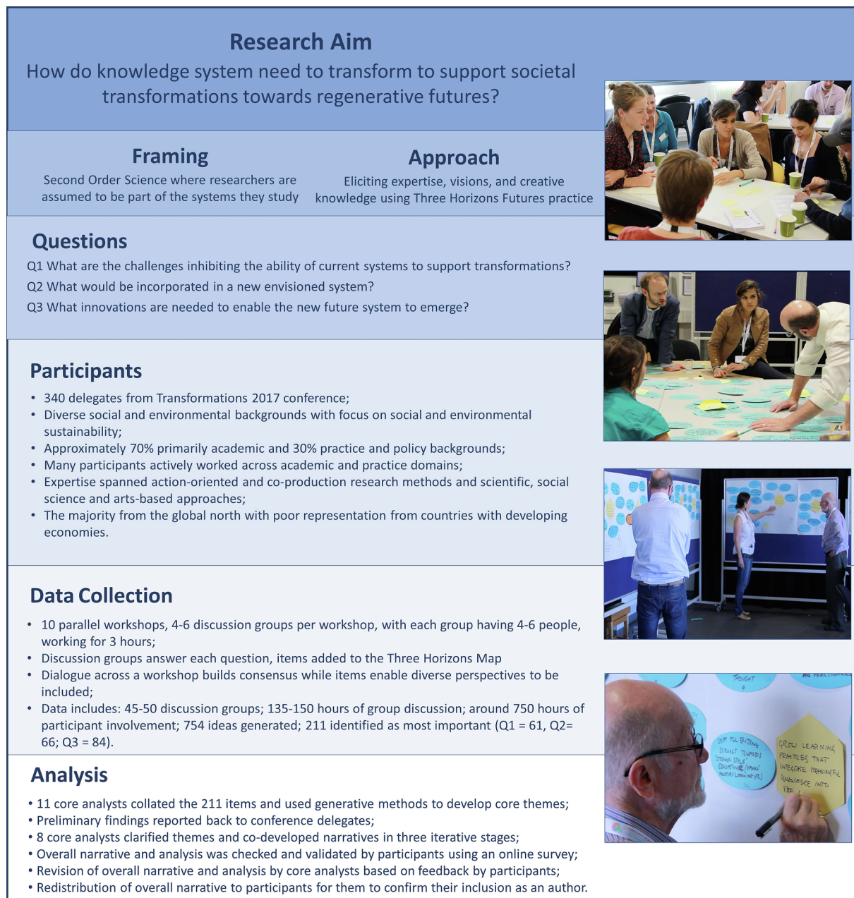
Box 1. The research methodology.

Multiple checks and balances were used throughout the process to ensure the results and narrative reflected the views and perspectives of researcher-participants and reduce biases created by interactions of research-participants acting in different roles, such as facilitators, analyst and participants in accordance with suggestions for enhancing rigor [36]. This included: (1) Sharing and deliberation of ideas in the parallel workshops at the conference; (2) careful coding and preliminary analysis using multiple analysts who had been present in different workshops; (3) feeding back preliminary analysis to participants during the conference; (4) multiple iterations of cross-checking by multiple analysts post conference; (5) working with comments from the researcher-participants about the overall narrative; and (6) final approval of the narrative through participants by agreeing to be a co-author before the paper was submitted. In this last stage, only one person declined to be an author, while four newly joined after email communication errors had been clarified. Combined with the facilitators and analysts, this led to the total of 183 authors on the paper. In conclusion, while a different group of participants may have led to