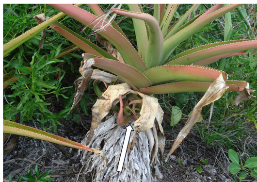
Fig. 2. Aloe pembana young vegetative shoot on the side of its upper stem at Pemba island, December 2018 (picture by Siri Abihudi).

The species of “Least Concern”, A. lateritia , outperformed other species across all treatments in its germination success, followed by A. secundiflora and A. volkensii . This is supported by other researchers who reported the first two species being widely distributed across different geographical areas of various climatic conditions (Abihudi et al., 2019; Bjorå et al., 2015;