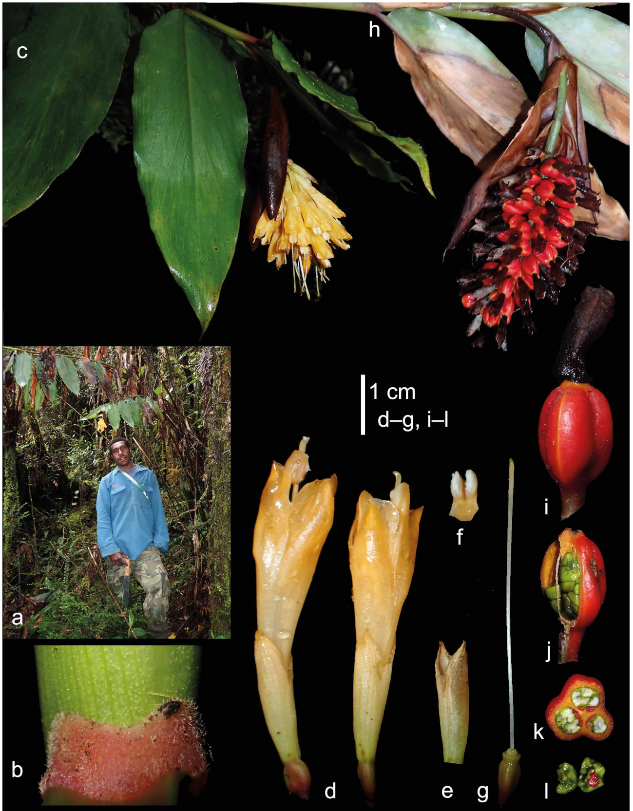
Fig. 4 Pleuranthodium piundaundense (P.Royen) R.M.Sm. a. Habit (Thomas Mundua demonstrating the size of the plant); b. ligule; c. inflorescence; d. whole flowers; e. calyx; f. stamen, ventral view; g. ovary, style and stigma; h. infructescence; i. fruit; j. fruit, part of capsule removed; k. fruit, cross-section; l. seeds and aril (Poulsen et al. 3023; E, LAE).