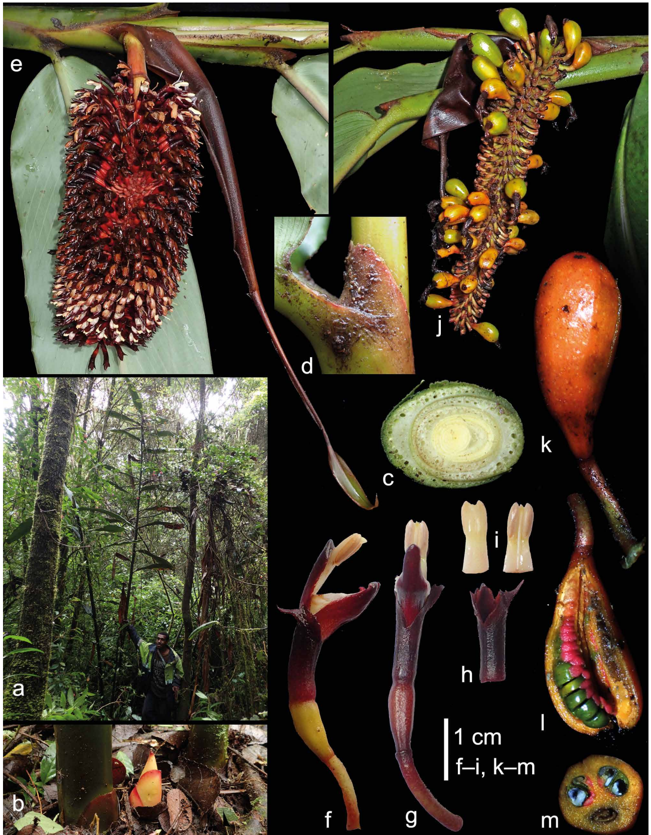
Fig. 2 Pleuranthodium corniculatum Lofthus & A.D.Poulsen. a. Habit (Thomas Mundua demonstrating the size of the plant); b. bases of leafy shoots and new shoot; c. cross-section of pseudostem; d. ligule; e. inflorescence; f. flower, lateral view; g. flower, dorsal view; h. calyx; i. stamen, dorsal and ventral view; j. infructescence; k. fruit; l. fruit, part of capsule removed exposing green seeds and pinkish red aril; m. fruit, cross-section (Poulsen et al. 3019; E, LAE).