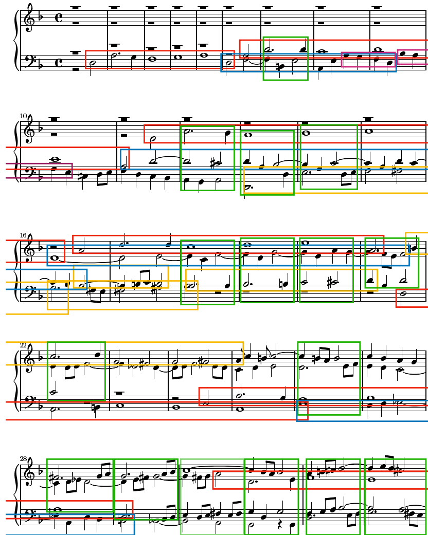
Figure 1. Motivic analysis of the beginning of Contrapunctus XIV . The first subject is shown in red and its corresponding countersubject in blue.

figures as well) will lead to the vertical inversion of particular occurrences as well.