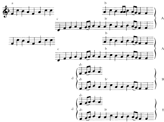
Figure 2. Paradigmatic analysis of a Geisslerlied [6].

ally played are shown, so they progressively “light up” as the music goes.