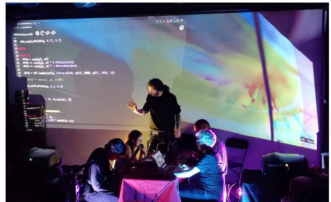
Figure 1: The second performance of RAW at the Web Audio Conference 2019 in Trondheim.

One challenge with playing such air instruments, is that the performance may bridge over to the aesthetics of theater acting and dance. We will leave that problem aside here, and focus on the types of air performance that is clearly situated within a context of music. Still there are several conceptual and practical challenges in how such instruments