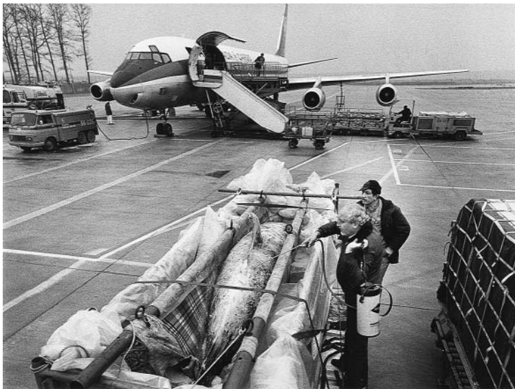
Figure 7b. Killer whale at Frankfurt Airport, circa 1970s.

unweaned mammals for instance. Here, size as a related factor comes to play since younger and smaller giraffes that are small enough to fit into a cargo plane would often not be weaned. It is also part of the artificial microecologies of animal transportation that, during takeoff and landing, captains have to take the needs of their animal passengers in the cargo space into account. Horses especially are not able to cope with very steep (climb) angles during takeoffs. 60 Animal agency and their habitats are thus built into the material culture and practices of animal air logistics.