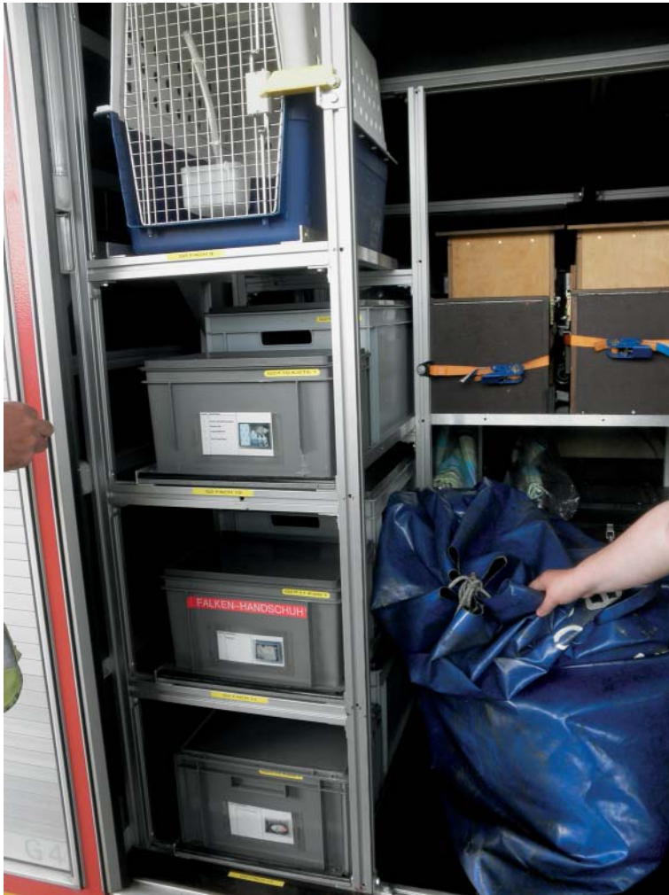
Figure 8. Animal tool kit at the fire department of Frankfurt Airport.

the animal protection unit are required to hold depending on responsibilities. Courses in animal rescue include training with farm animals and group exercises working through specific scenarios. One of those scenarios was rescuing a circus hippopotamus drifting away and scared by the tourist boats on the Rhine River. The group of trainees had to come up with a rescue plan, including the equipment needed, the problem-solving strategies, and transportation for the hippo back to its home base. Thus, the very knowledge of animal protection staff is grounded in practical knowledges and highly local in its embeddedness in Frankfurt Airport's fire department, yet at the same time it is highly specialized and transnationally networked through IATA standardizations.