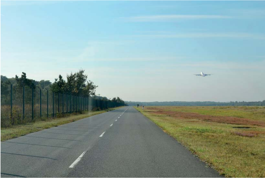
Figure 4. Tarmac and forest along Runway West at Frankfurt Airport.

allowed to grow. The long grass made it more difficult for raptors to find their prey, like mice. 43