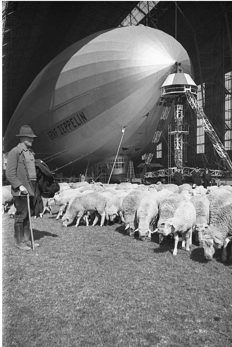
Figure 3. Shepherd, sheep, and airship at Frankfurt Airport circa 1930s.

faster jet aircrafts. Following a major accident in the late 1950s—a roe deer had run into the front wheel of a KLM plane—the German Federal Aviation Authority demanded that Frankfurt Airport avoid animal collisions on the airfield as a top priority. As a consequence, a new border was established: the airfield was completely fenced with wire mesh—and it has remained like this ever since. This fence created a new legal space, because the area within the fence became a private hunting ground. A wide range of hunting practices were applied to clear the airfield from all kinds of animals: from traditional shooting to drive hunting and ferreting. Later, lethal gas was even used in order to wipe out rabid foxes. 38