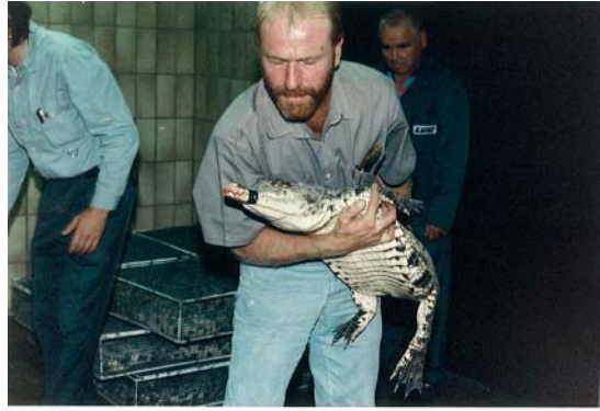
Figure 5. Animal handling at Frankfurt Airport, undated.