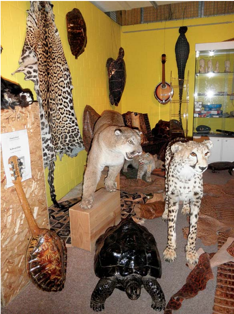
Figure 6. Stuffed animals at customs.

guidelines applied by airlines. Nonhumans are part of the border patrol staff, too. Dogs specialized in sniffing drugs, weapons, explosives, money, and the remains of endangered species help the human officers to detect illegal items that then are stored in a special room, the so-called Asservatenkammer (court exhibits room). Over the decades Frankfurt Airport has accumulated an impressive collection of stuffed animals endangered by extinction such as wildcats; animals like turtles or crocodiles processed into handbags, belts, hats, shoes, and musical instruments; and huge amounts of ivory (fig. 6). However, smuggling is not only limited to dead animals but also includes living animals. Often passengers are not even aware that they are smuggling while carrying a cute, beloved, or “salable animal like cats, turtles, or even spiders.” 56 In this case, they usually end up in the Animal Lounge to await repatriation.