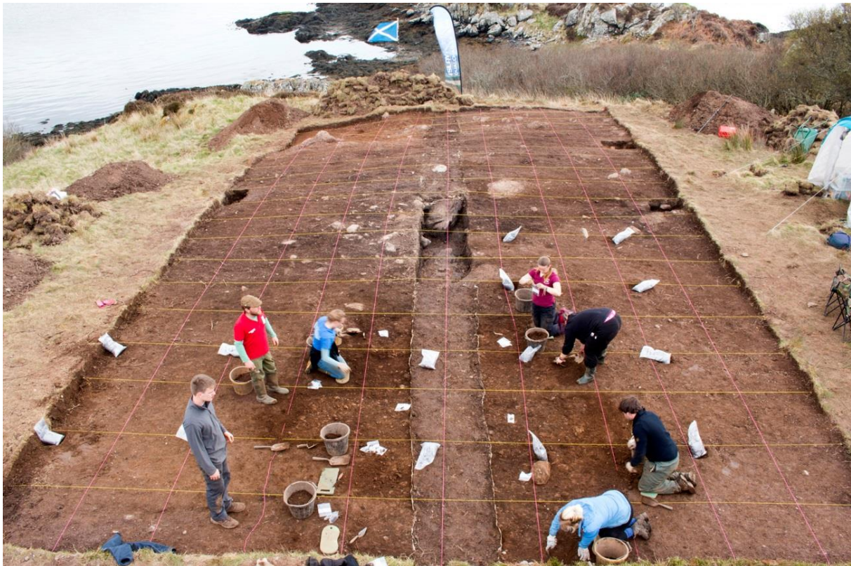
Figure 3. 2017 excavation at RPAS

In 2017, we opened a 10 m by 15 m trench at RPAS (Figures 1 and 3). During that season of excavation, we were able to remove Contexts 114 and 115 from the southwestern and central parts of the trench exposing the stratigraphy illustrated in Figure 2 as defined during the 2013 evaluation: Context 114 is the topsoil immediately below surface vegetation and Context 115 the underlying sub-soil. This contains Mesolithic artefacts but these are likely to have been disturbed and redistributed. Context 115 is above undisturbed Mesolithic deposits (Contexts 101, 110). In the north-eastern part of the trench, however, the stratigraphy had largely been lost by erosion and re-deposition, suggesting the assemblage from this area is derived from the complete sequence of cultural deposits at RPAS as identified in 2013, combining artefacts from Context 111 with those from 101, 110, 115 and 114.