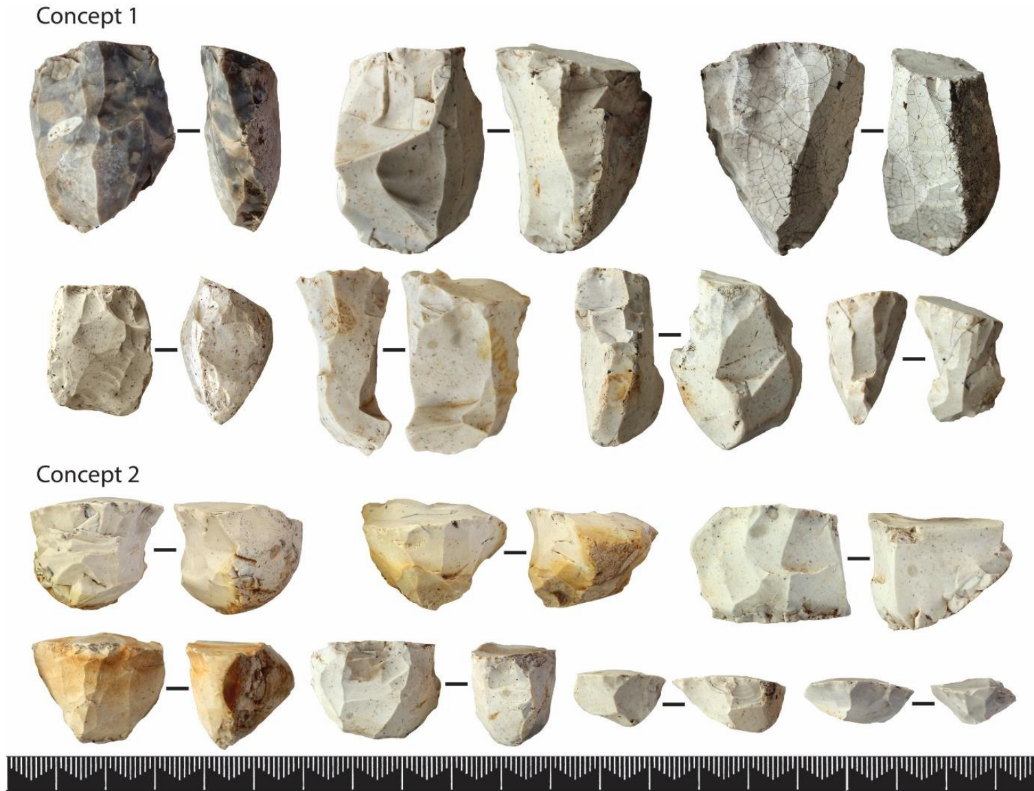
Figure 5. Concept 1 and Concept 2 cores from RPAS (scale bar: cm and mm).