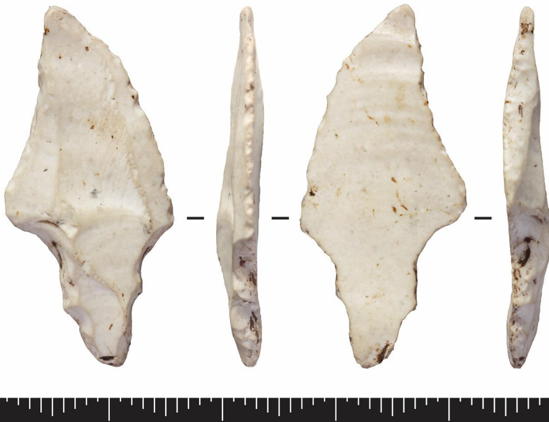
Figure 4. The small tanged point from 2010 test-pit (10,10) at RPAS. Largest dimensions are length: 31.9 mm, width: 14.5 mm, thickness: 3.7 mm, weight: 1.2g, noting that these are of an abraded artefact (scale bar: cm and mm)

leaching from prolonged contact with seawater or by some other means of patination. It is also abraded, possibly from being water-rolled. The unretouched edge displays some edge-damage, which we interpret as coming from post-depositional movement.