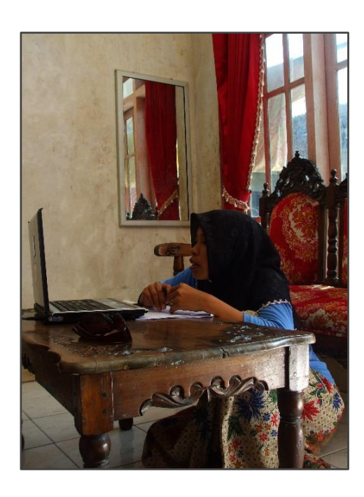
Figure 2. Participant working on the modality questionnaire in 2011. (used with permission)