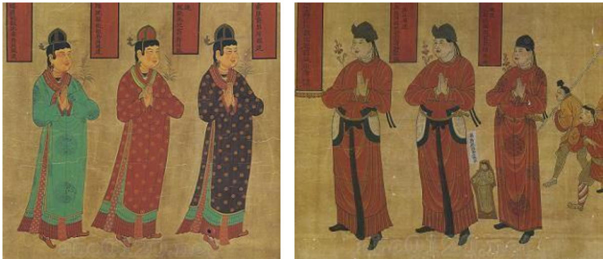
Picture: Xixia buddhist supporters, left for female, right for male; 21

We can try to answer this question from looking into the Xixia female images.