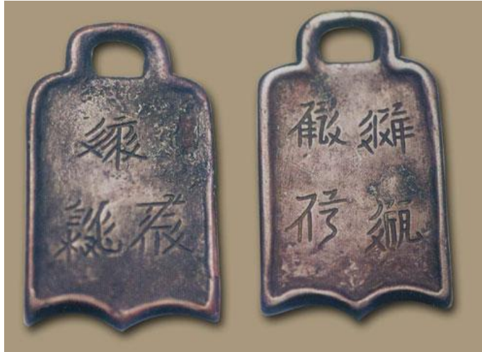
Picture: Tally of Daiming in Xixia 9

However, even if it is similar to the Mongol kesig, Daiming in Xixia seems not as prestigious as kesig in Mongol system who work even as part of the administrative system. But still, it is still extremely demanding and glorious in Xixia to be Daiming, since they are so close to the imperial family that they can virtually be part of the authority. Therefore, candidates who want to be Daiming have to go through rigorous and thorough censorship to be absolutely clean and for some positions they need to have a prestigious guarantor in order to be entitled to the position 10 .