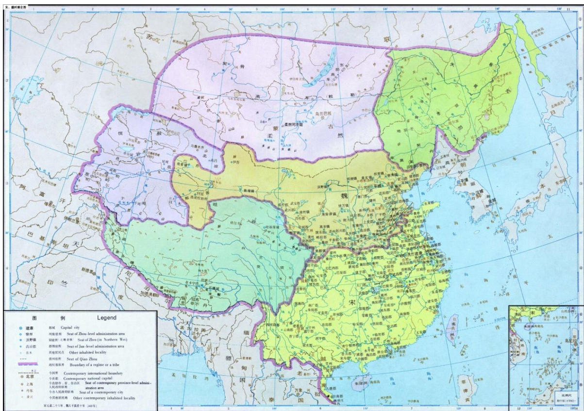
Picture: China in Northern and Southern Dynasties

Xianbei, in fact, built the first conquest dynasty in China---Northern Wei. Being a major dynasty other than a regime that existed for merely a couple of years, Northern Wei grew out of the dozens of alien kingdoms in the Age of Division, or the so-called Sixteen Kingdoms, from a tribe that had almost vanished to an empire that covered not only north China but also the most part of the steppe south to Rouran.