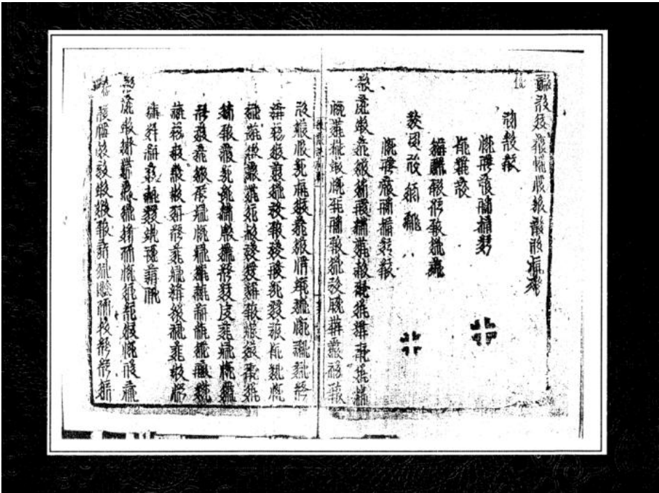
Picture: Photocopy of the front page of Tiansheng Code 4

Thanks to the discovery of the Tiansheng Code, we got to know many different sides of Tangut society and how the legislators view the different social phenomenon at that time, and most importantly, what they do to control crimes and control the society.