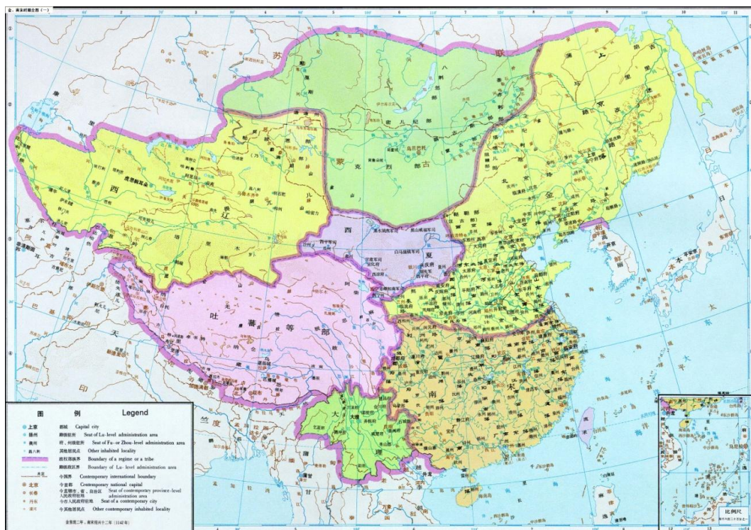
Map: Territory of Jin in 1142, source: 46

The Jurchen Jin is the dynasty that shares the shortest history among all the four ‘conquerors’ listed above. In 1115, Jurchens named their country ‘Jin’ and this ethnic group ‘Jurchen’ officially stepped onto the historical stage. Within 12 years the new country terminated both Liao and Song and became the owner of the north.