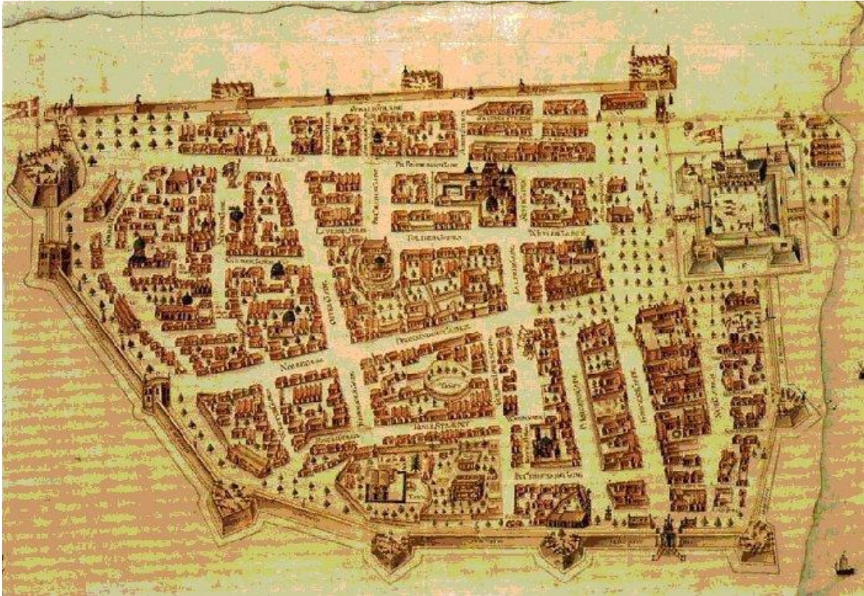
Figure 2. Map of Tranquebar during the Danish colonial period