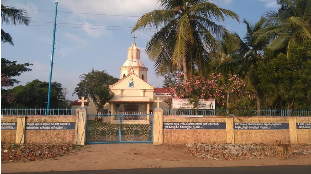
Figure 4. The Holy Rosary Church