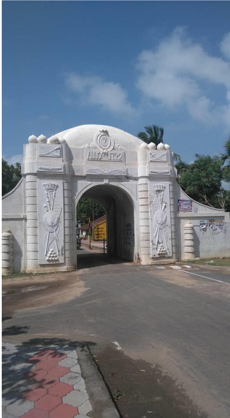
Figure 7. The "Land Gate", a structure from the Danish colonial period that is a tourism attraction.