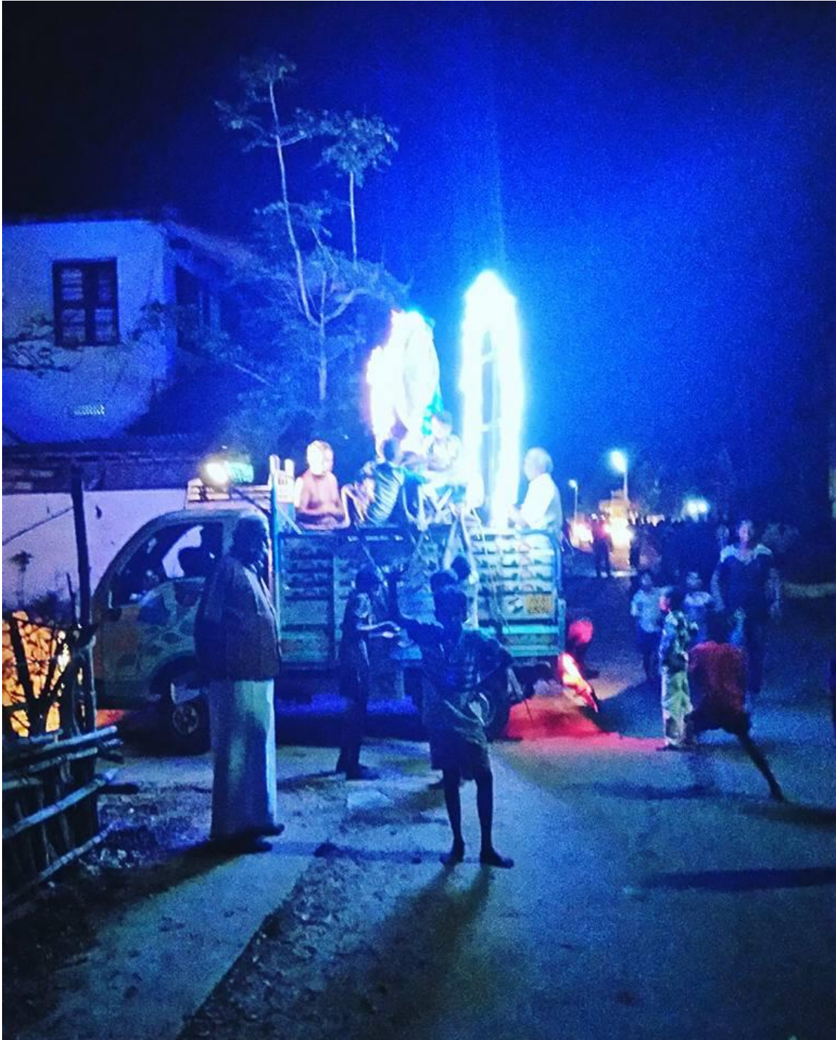
Figure 3. Hindu parade in the month of March.