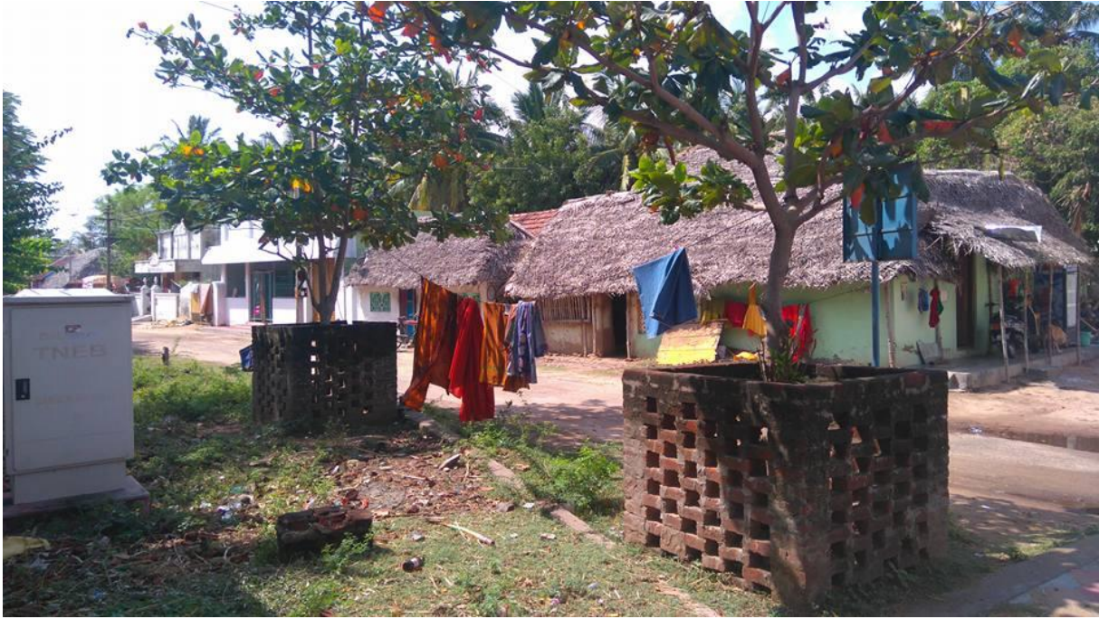
Figure 6. Residential street.