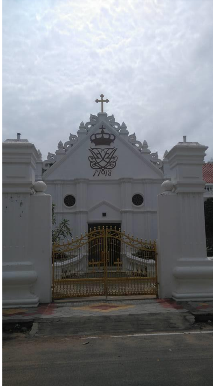
Figure 5. The New Jerusalem Church