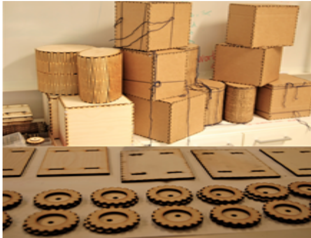
Figure 2. Top: Basic shapes. Bottom: Laser cut wheels