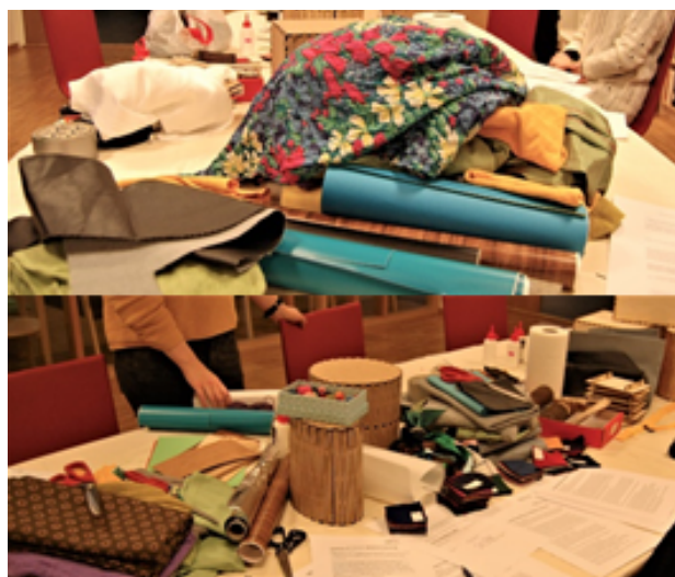
Figure 1. Workshop setup

One of the things we observed in the pilot workshop was that prototyping a robot with no structural building blocks was troublesome. To minimise crafting tasks that were demanding in fine motor skills and still provide the participants with flexible choices regarding material samples, we prepared building blocks in the form of cardboard and veneer boxes and shapes to represent robot bodies and wheels. See Figure 2. We made the boxes from scratch to standardise the height of the boxes to prepare material samples that could easily be fitted onto the base boxes. We tailored the other material samples like textiles to this measure.