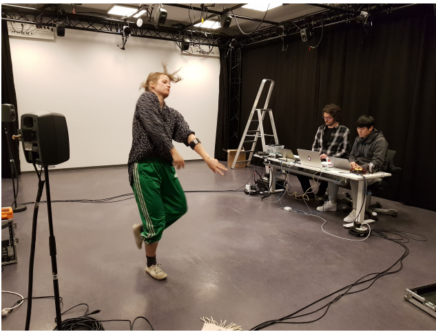
Figure 4: The dancer, the musician and the second musician in a rehearsal.

Her impressions about co-performing on the same instrument is described as “playing together while accessing each other’s skills.” She uses the Norwegian word “vrengt,” which she exemplifies as the act of turning a sweater outwards, pointing to how the artistic intentions and skills are merged together. Furthermore, she emphasizes how each different sound object has a distinct image in her mind (see Table 1) and she “examined the duration, pace and consistency of every movement within them.” Reflecting on the use of abstract algorithms for sound synthesis, she comments that they resemble shapes that she can “fill with any image you want.” This can be seen as opposed to more straightforward sonic imagery of physics-based models. Moreover, she cannot choose one or the other technique in terms of the level of engagement and embodied control. It is an important user-centered aspect, which should be further investigated.