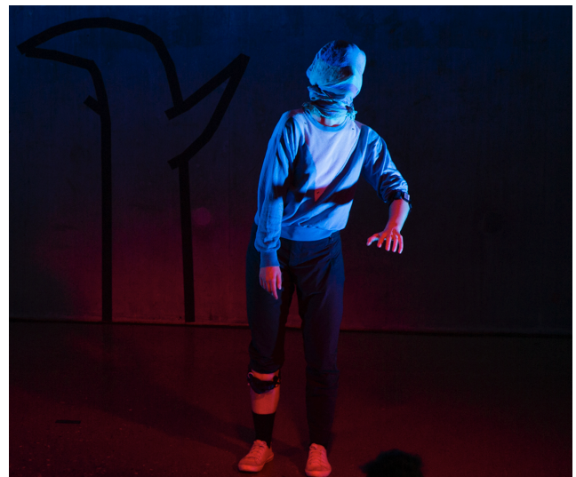
Figure 1: The dancer, blindfolded, in the first live performance of Vrengt .

In today’s experimental performance scene, many musicians are exploring performance practices that approach dance, and many dancers are working with interactive music systems. A challenge in such exploration, however, is fundamentally different intentions ranging from particular embodied practices [36]. For a musician, the sound is the primary focus of attention, and the movements needed to produce the sound (the sound-producing and sound-modifying actions) are the result of that aim. For a dancer, on the