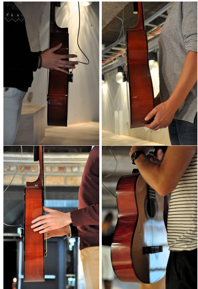
Figure 4: Connecting with the guitars through different holding strategies. By lightly touching the body of the instrument, participants can feel the sound of their guitar and at the same time find a focal point for standing still.

The 'breathing' sound layer was programmed with a noise