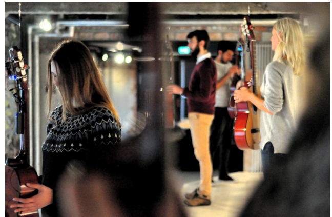
Figure 1: A performance with the installation Sverm-Resonans . Each guitar is an independent instrument controlled by the microinteractions of a still-standing human.

Is it possible to play an acoustic instrument by not moving? The project reported on in this paper is the merging of several different trends we have seen in the NIME community