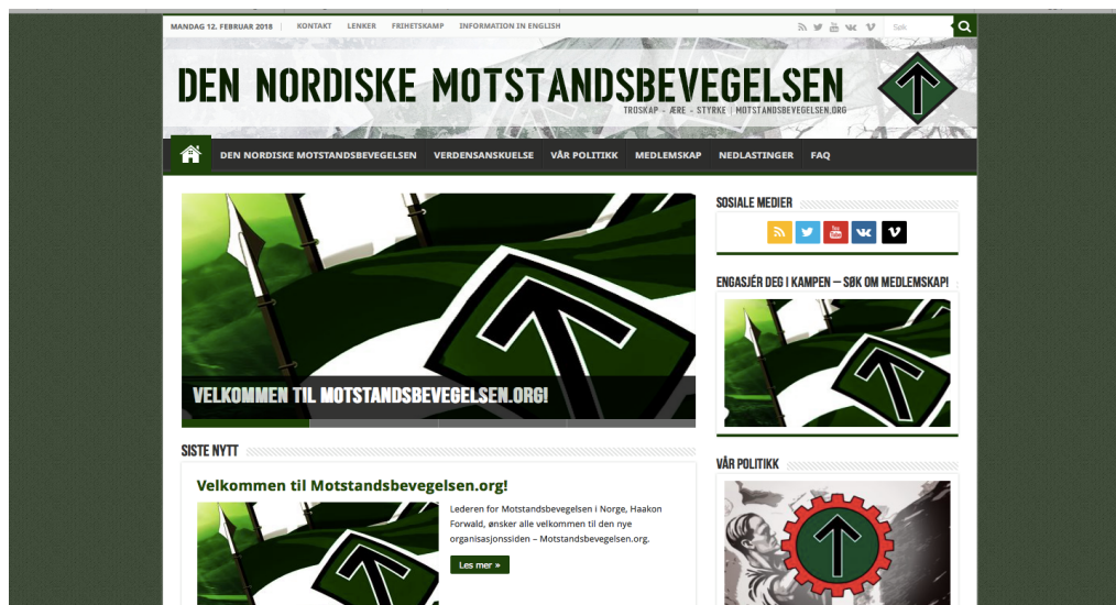
Screenshot of The Nordic Resistance Movement's website; www.frihetskamp.net on 12th January 2018.

The YouTube clip published by NRM was added to the dataset quite late in the analytical process, as it was not posted before the beginning of January 2018. A considerable amount of the analysis had already been written at the time, but we saw the video to be interesting in the way the group portrayed themselves and how they glorified what they had accomplished in 2017.