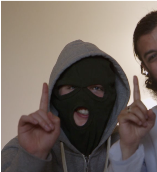
Screenshot from NRK Brennpunkt documentary: Den Norske Islamisten . Picturing two members of The Prophet's Ummah.