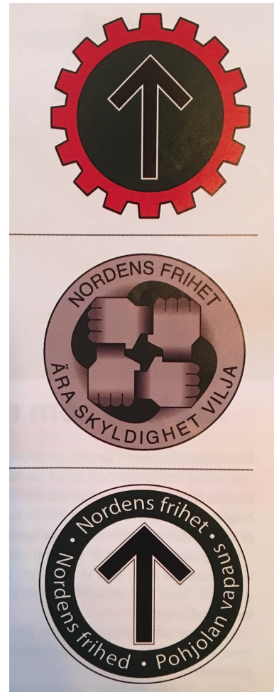
NRM’s most common symbols.

In a video summary published by The Nordic Resistance Movement, named “Battle Year 2017”, shows 11 minutes and 2 seconds of different clips from events that took place throughout the last year. The video portrays several violent clashes between The Nordic Resistance Movement’s members and opponents or police, as well as hand-held camera footage of different local wings burning Pride flags, or vandalising public property, combat training and speeches during their political summer camp. They have also documented forest walks, outside bonfires and members drinking from waterfalls. The clips are accompanied by dramatic and grandiose music. At the end, two central members deliver this message: