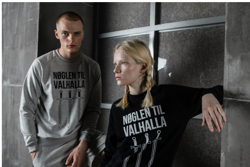
Picturing ‘nipsters’.

Among European right-wing activists, it seems like the traditional skinhead look is no longer the desired cultural expression, and young Nationalists and neo-Nazis appear more influenced by the mainstream (Agenda Magasin, 2017). In Germany, the Nationalist party ANP openly wish to appear less intimidating and be a place where people with different styles can come together through shared opinions and politics, rather than as a stigmatised subculture (The Rolling Stone, 2014). In this way it becomes increasingly difficult to distinguish between mainstream youth and right-wing radicals based on their appearance alone. This emerging stylistic expression of neo-Nazi fashionistas has been referred to as the ‘nipsters’; the Nazi-hipsters or Nationalist-hipsters.