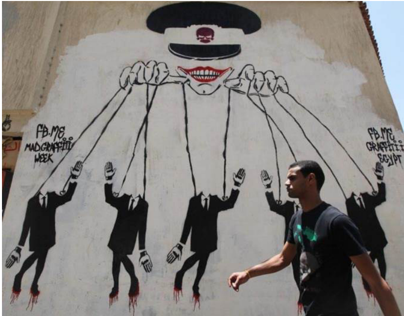
Fig. 3: Mad Graffiti Week (Facebook group), Joker as a puppeteer, 2012. Cairo.

However, the majority of Egyptian artists I interviewed considered themselves street artists, resorting to graffiti and calligraffiti as one of their many modes of expression and techniques. Accordingly, they consider street art, which is also referred to as “urban art,” the art of the subaltern, political protest, and one of their many modes of expression and techniques. Graffiti includes a great variety of genres and styles and mixes several graphic genres such as calligraphy, poster art, and graphic novels (Genin 2013, 22–32). The word “graffiti” combines the notion of writing derived from the Greek, graphein , to write, and that of incising, from the Italian sgraffiare , to scratch. The term is used in art history and archaeology to designate inscriptions and drawings that have been added to a cave, monument, statue, or painting. Graffiti has existed since the most ancient times and several sites and monuments dating from prehistory, pharaonic Egypt, Ancient Greece and the Roman Empire show the passage of time through the names, words, phrases, and drawings people have inscribed on them while visiting. Today, graffiti range from simple words, the artist’s signature or tag, or short phrases to elaborate wall paintings or pieces. The term “calligraffiti” was coined by the Dutch graffiti artist Niels Shoe Meulman and denotes the combination of traditional calligraphy, with its strict rules and methods, with the nonconformity and openness of graffiti and