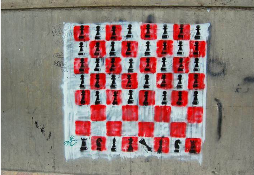
Fig. 6: el-Teneen, The king is down , 2011. Cairo.

want to refuse to be an imitator or follower of the West, yet you also refuse the regressive interpretation of your heritage. ‘A thousand Nos’ are not enough. (Goethe Institute, n.d.).