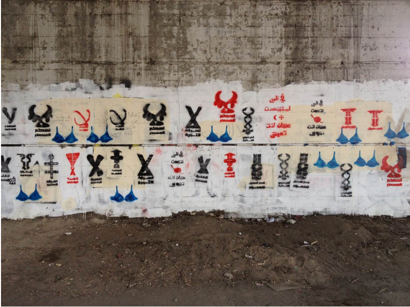
Fig. 7: Bahia Shehab, No, and a Thousand Times No, 2011. Cairo. Calligraffiti.