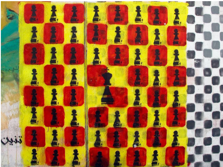
Fig. 15: el-Teneen, The king is back , 2014. Cairo. Photo: el-Teneen.