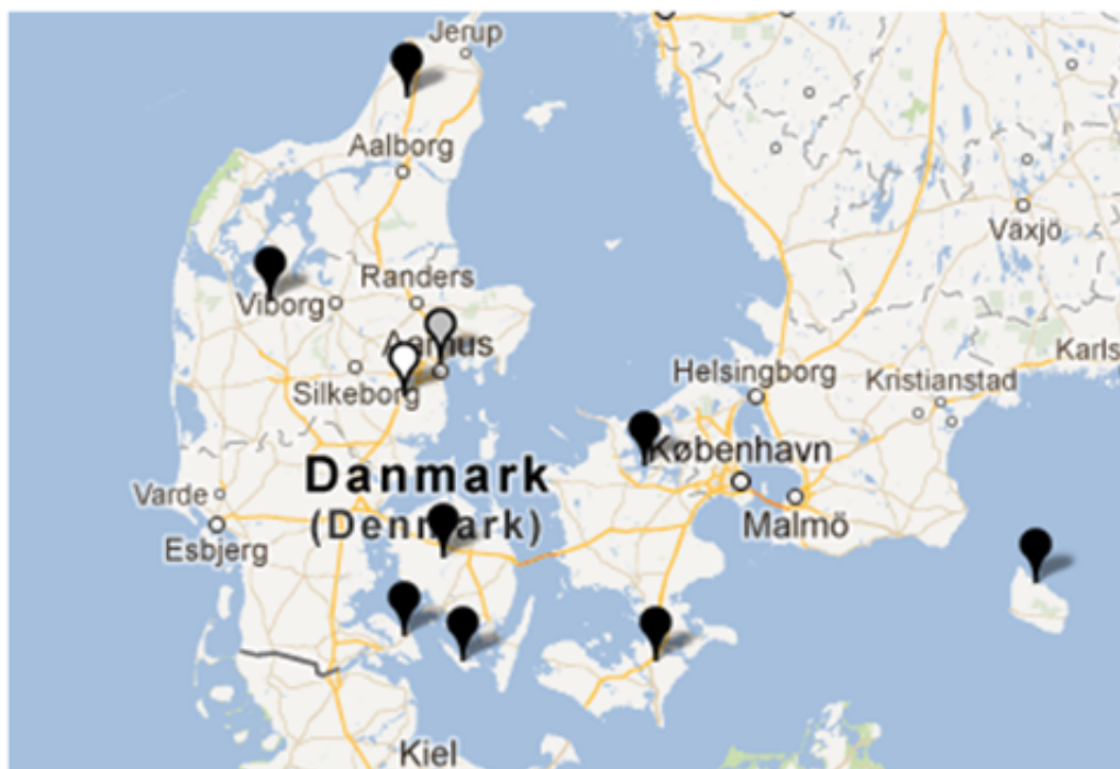
Map 1. Double complementizer in Danish: hvis 'if' + at 'that' in conditional clause (#367: Hvis at du kommer på besøg, blir vi meget glade. 'If you come to visit, we'd be very happy.' )

In Denmark, sentence (#367), with a conditional clause with the complementizer hvis/ef 'if' + at/að 'that', is accepted only on Eastern Jutland; see Map 1. It receives a medium score in Århus (also Eastern Jutland). On Iceland, on the other hand, the sentence is accepted in most locations; see Map 2. It receives a medium score in a few locations in the north and in the southwest.