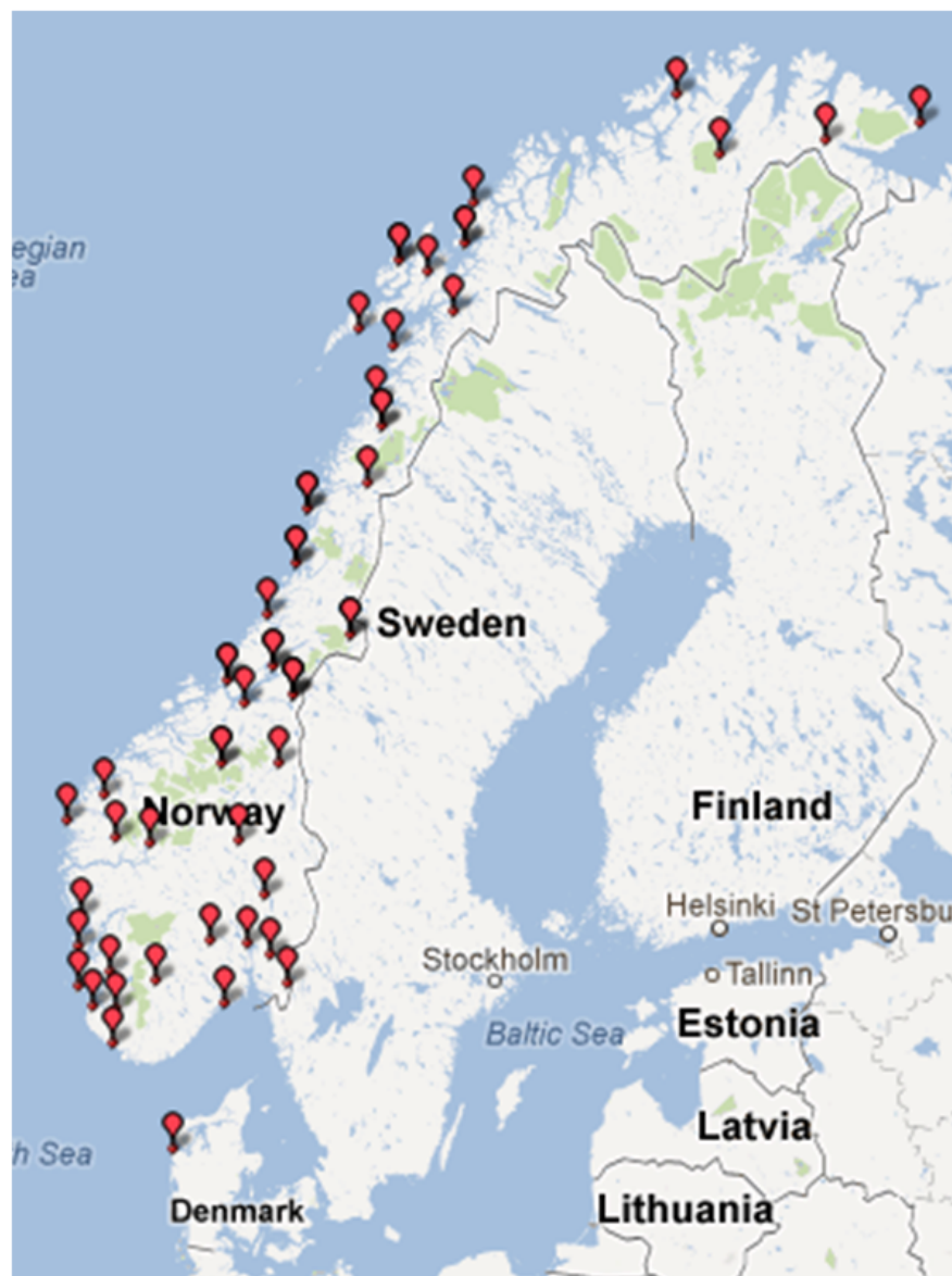
Map 7. Hvis 'if' + at 'that' in the Nordic Dialect Corpus.