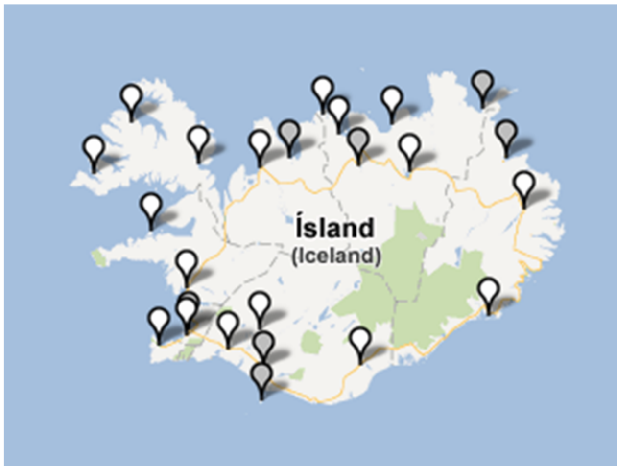
Map 2. Double complementizer in Icelandic: hvis 'if' + að 'that' in conditional clause (#367: Hvis at du kommer på besøg, blir vi meget glade. 'If you come to visit, we'd be very happy.' ) (White = high score, grey = medium score, black = low score)

Also sentence (#370), with når 'when' + at 'that', is rejected in all locations in Denmark, except on Eastern Jutland where it receives a medium score; see Map 3. On Iceland, on the other hand, sentence (#370), is accepted in all locations, except in one location in the southwest, where it receives a medium score; see Map 4.