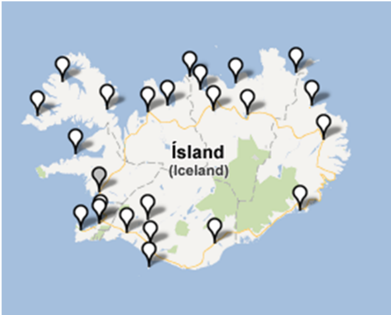
Map 4. Double complementizer in Icelandic: þegar 'when' + að 'that' in a temporal when-clause (#370: Når du kommer, skal du tage aviser med. 'When you come, you must bring newspapers.') (White = high score, grey = medium score, black = low score)

Sentence (#369), with an embedded question with om 'whether' + at 'that', is rejected in all locations in Denmark; see Map 5.