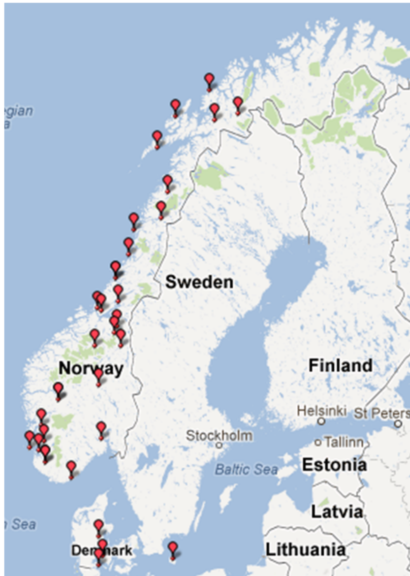
Map 6. Når 'when' + at 'that' in the Nordic Dialect Corpus.