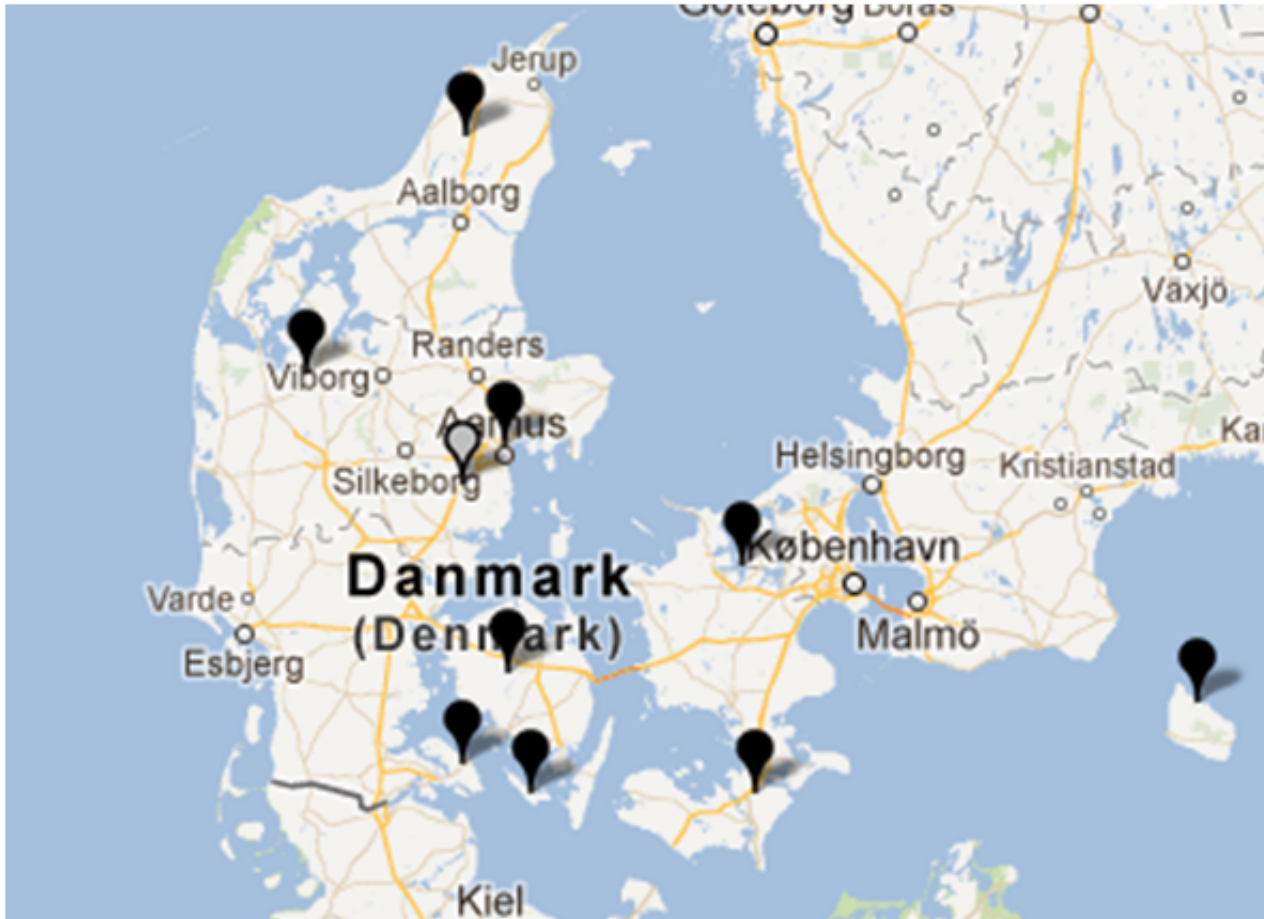
Map 3. Double complementizer in Danish: når 'when' + at 'that' in a temporal when-clause (#370: Når du kommer, skal du tage aviser med. 'When you come, you must bring newspapers.')

(White = high score, grey = medium score, black = low score)