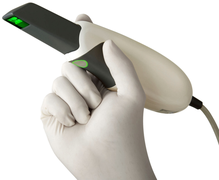
Fig.5 Intraoral scanner ( www.carestreamdental.com )

The dental arch of the suspect can be directly scanned using an intraoral scanner. There are different types of intraoral scanners by different manufactures available in the market. The indirect scanning is done by scanning the cast of the dental arch, that is made by conventional methods. 3D scanning can be very efficient as it saves time and have the digital storage options. (see also chapter 6)