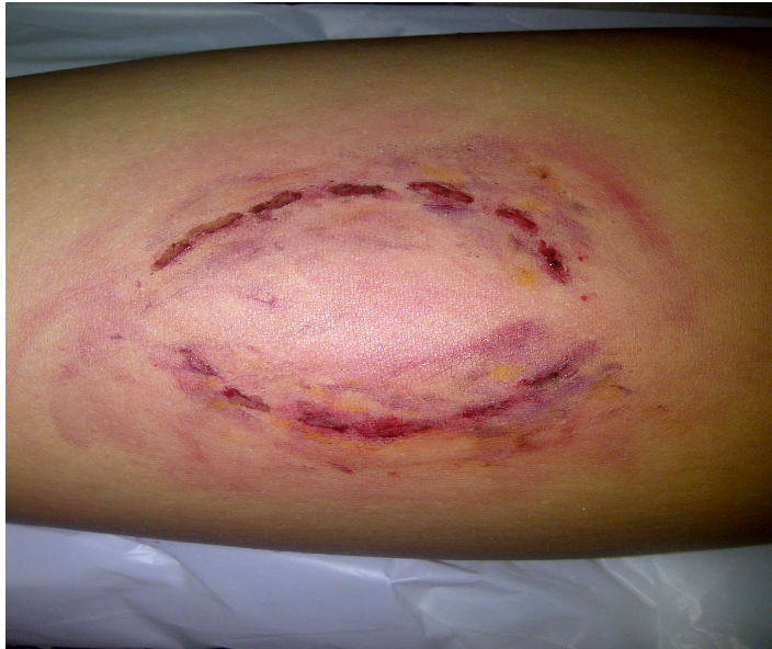
Fig 2 Bitemark ( www.thinglink.com )