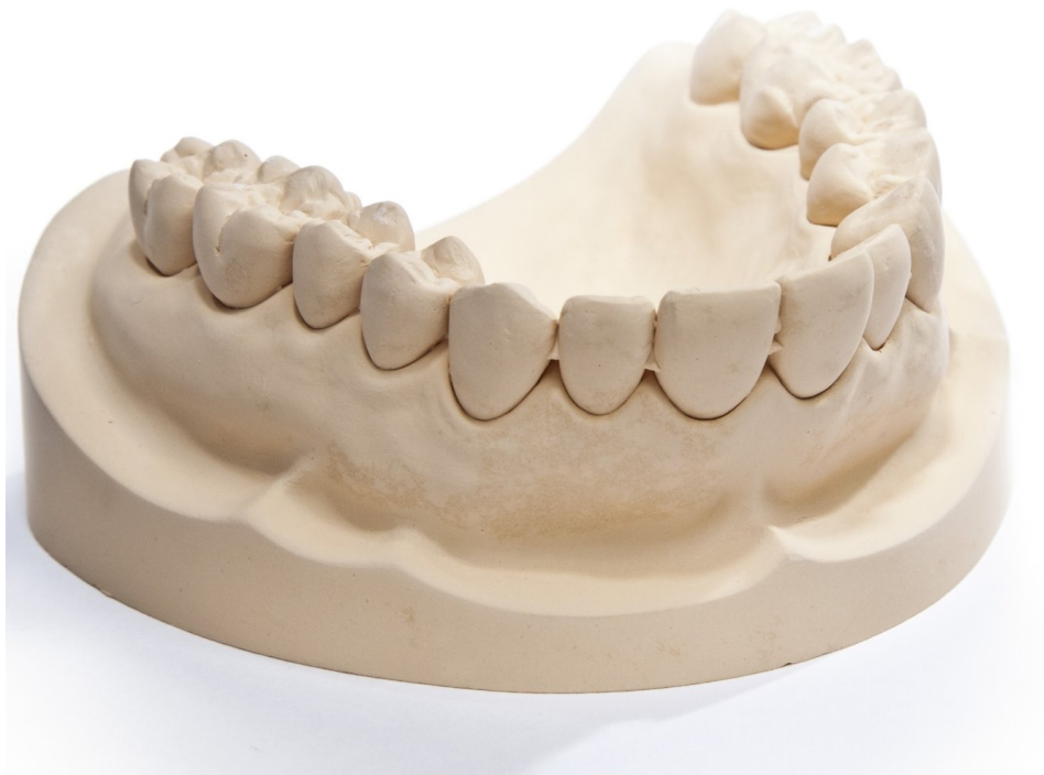
Fig. 4 Dental cast ( www.dentona.de )

Study casts are made from the impressions of the bitemark. It is important to identify, preserve and store the initial pour master model in a secure area in a specific container(5). The suspect's dental cast is also made and recorded for either direct or indirect comparison.