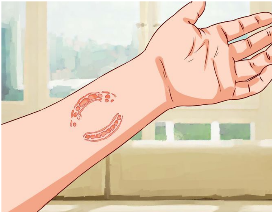
Fig .1 Human bitemark

A bitemark has been defined as “the physical end product of a complex set of events that occur when human or animal teeth are applied to the skin or foodstuff (1). In bitemark analysis , uniqueness of the human dentition is the fundamental premise (2). Bitemark analysis is mainly supported by two assumptions. The first one is the uniqueness of human dentition when it comes to positioning of teeth in the jaw and the second is that how that individuality is replicated on the human skin (3). In the administration of justice, bitemark analysis may be used as an evidence in the judicial system. Forensic odontology have always been a part of human identification process of both victims and suspects. In bitemark cases, the registered bitemark injuries is compared to a suspect’s dentition where as in human identification it is comparison of victim’s post-mortem dental registration and ante-mortem dental data (4). To discriminate the biter and exclude others is the most useful outcome of bitemark interpretation (5). There are three moving systems that are involved in the dynamic act of biting : the maxilla, the mandible and the reaction of the victim (3). During the act of