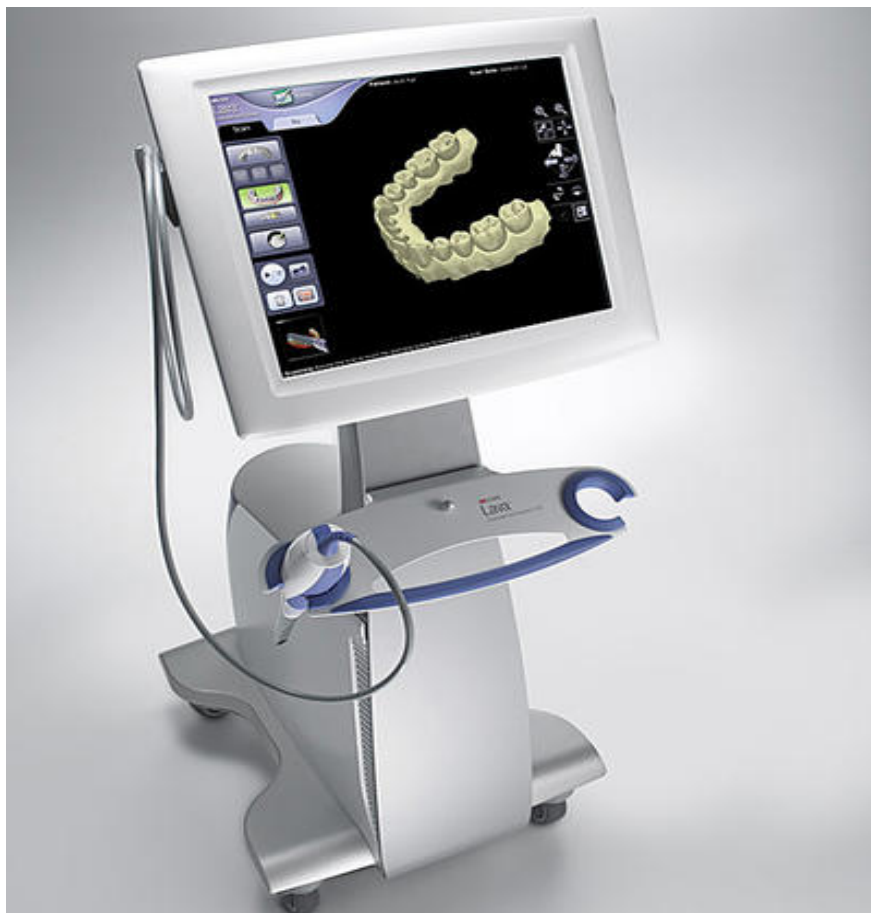
Fig.6 3D Scanner (news.mit.edu)

A 3D scanner gathers geometric data from the surface of an object and helps in reconstruction of the object's shape. The two types of 3D scanners that are used in tooth mark analysis are contact and laser scanners (11). Contact 3D scanners (point to point or linear) analyse the surface of the object with the help of a probe with a hard steel or sapphire tip and the spatial position of the probe is determined by a series of internal sensors which in turn result in the reconstruction of the object from the point clouds (11). In 3D laser scanners, a laser beam is emitted and detect its return to record the geometry of the object by triangulation (11). To gather data from all sides and to reconstruct the object, multiple shots are made from different positions. A reference system is used to coordinate all the shots and to create a complete model by bringing together the individual scans (11). Molina et.al conducted a study to compare the accuracy of contact and laser scanners that are used in tooth mark analysis (11).