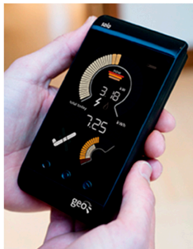
Figure 2. Solo II in-home display.

To obtain spread in the total sample we therefore decided to include a number of flats in a housing association in Oslo (Røverkollen) where the Board had a positive attitude towards collaborating and facilitating the recruitment of families. In addition to the above mentioned reasons, this housing association was selected because the flats were heated with electricity (electric resistance ovens), thus we expected the households to have higher electricity consumption (potentially increasing the effect of displays) than what would be the case in housing associations with water carried district heating as their primary heating source. The display Solo II is shown in Figure 2.