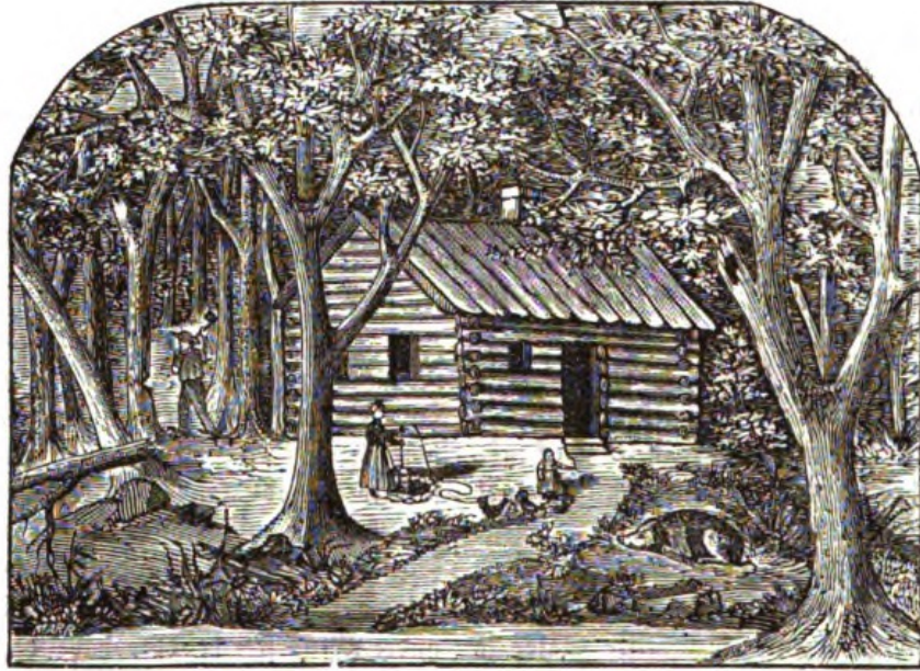
En Wisconsin-Farmers Hus for 10 Aar siden.