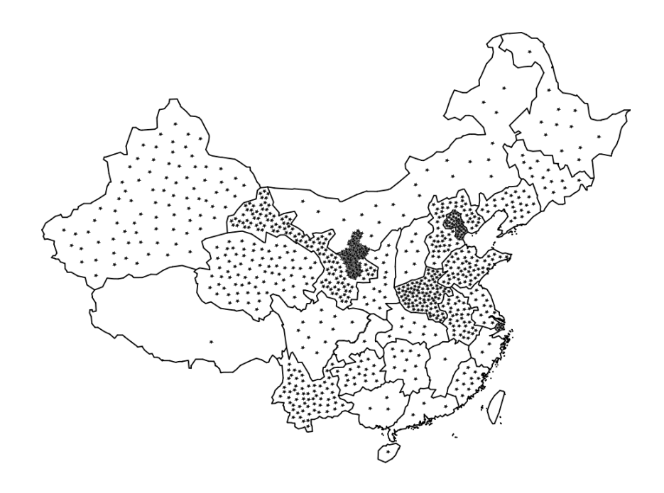
Figure 1. Distribution of Hui in China by province, region and direct-controlled municipality. Map made by author according to the 5th National Survey of 2000. Each star indicates 10,000 Hui. The allocation of stars within each province is arbitrary. Distribution is by household registration and not current living location. The largest concentration is in Ningxia with about 1.86 million Hui. The second is Gansu with 1.18 million Hui (Wang, 2012, pp. 183-184).

Chinese authorities labelled Hui are Hanhui 汉回<sup>9</sup>, Tuomao 托茂<sup>10</sup>, Yihui 彝回<sup>11</sup>, Kaqi 卡契 <sup>12</sup>, Huidai 回傣<sup>13</sup>, and Baihui 白回<sup>14</sup> (Wang, 2012, pp. 49-50).