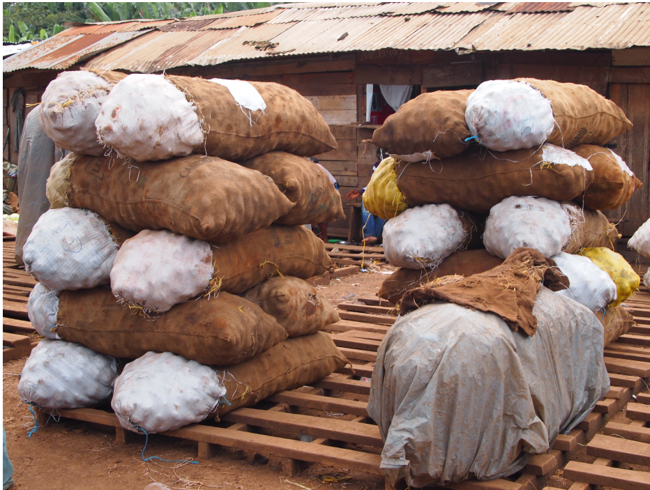
Picture: Fresh loads of Irish at the national market in Yaoundé.

market consisted of a huge square with some basic sheds surrounding it. The vegetables were scattered around the square on wooden pallets laying in direct exposure to the weather, it being sun or rain.