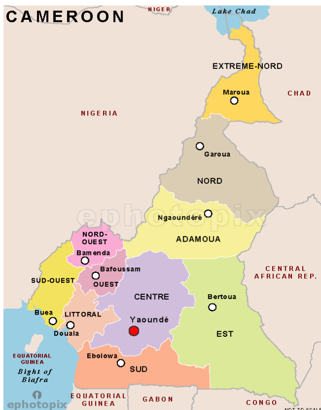
Figure 2: Cameroon and its provinces.

My fieldwork was conducted in M'muock Leteh, Fosimondi and a neighbouring French village in the Bamboutos caldera in the Western Cameroon Highlands, located right on the border between the Anglophone North West province and the French speaking western province. The Bamboutos caldera is surrounded by peaks and mountains that range between 2470 -2740m above sea level. The original settlement cores were sited along the bottom floor of the caldera, but the area has been subjected to large population movements over the past 50 years as people looking for new land to cultivate have moved up into the highlands to look for a better life. Around three quarters of the land consists of hilly terrain and steep slopes and the soils are highly fertile. The public roads reach only to the village centres, while community roads dug with local labour are the sole means of transportation to the dispersed settlements.