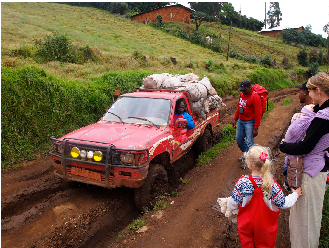
Picture 1: A pick-up truck trying to reach the village with a load of Irish.

struggled to get through the deep mud and past the huge holes in the road. Had it not been for a strong driver and helpful locals along the way, it would not have been possible to get all the way up to M'muock. We could see large trucks with agricultural produce standing alongside the road, where they had temporarily given up the fight to get down the mountainside to deliver potatoes and other vegetables on the national markets. The weather clearly determined whether access to markets would be possible, if the rain lasted longer than anticipated, the vegetables would be destroyed, waiting on the weather and the roads to be more accommodating. The community inhabitants would repair the roads themselves as soon as the rain stopped, and in M'muock they had mandatory community reparation groups that would rush to a site as soon as the rain ceased to fall. However, as long as the rain was still pouring down, there was nothing else to do but wait. Obviously, this has drastic impacts on the incomes of the farmers as they are producing fresh foodstuffs that need to be stored well or transported soon after harvest.