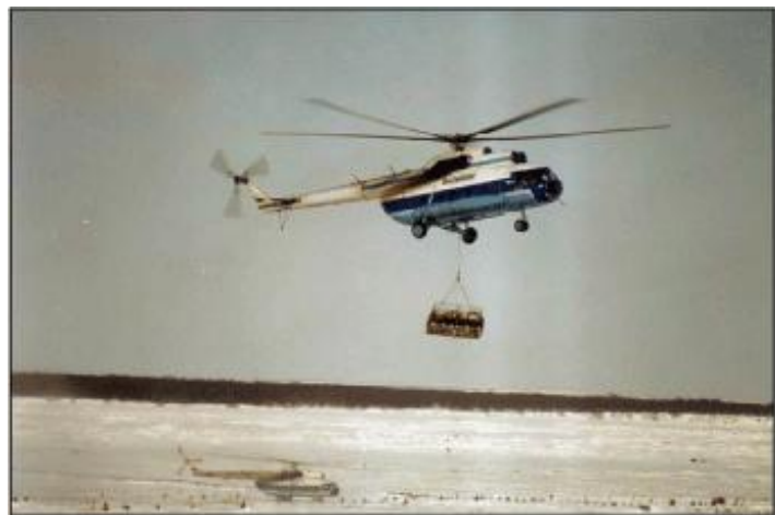
Figure 1. Helicopter hunt in the USSR

42 sealers were transported on the ice where they caught 4,800 pups (whitecoats) during six days (Potelov 1999). This method became the most economically sound in the years that followed. Thus, in 1964 the use of vessels in the hunt and coastal hunt was phased down.