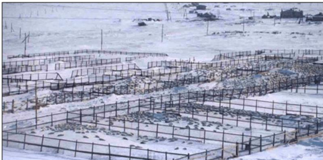
Figure 2. The sealing farm in Koida