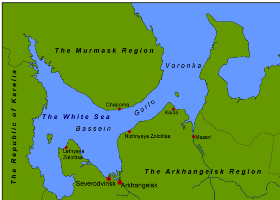
Map 1. The Arkhangelsk region and its surroundings

The Arkhangelsk region is located in the northern part of the European Russia and washed by three seas — the Barents, the White, and the Kara Seas. The area of the region is 587.4 thousand square kilometers, including the islands: Novaya