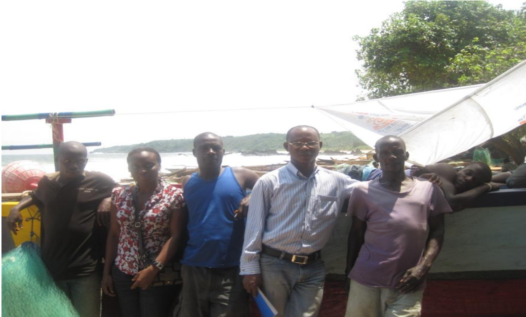
Figure 5: Researcher in a group photograph with fishermen at Cape Three Points.