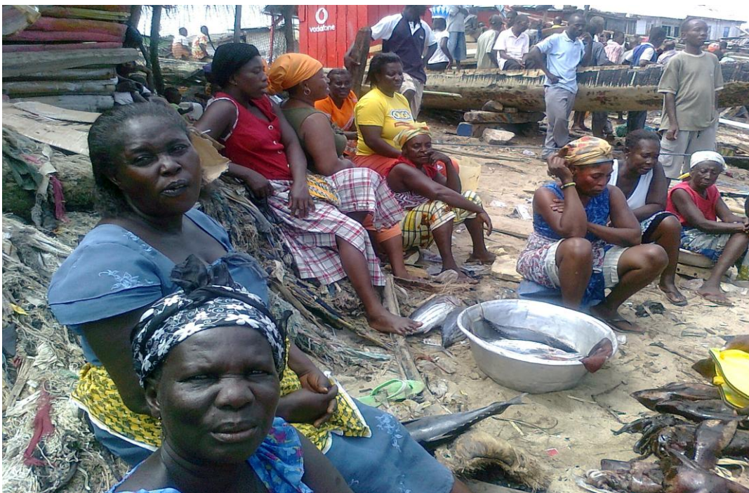
Figure 4: A section of fishmongers displaying their fish at the Dixcove shore.

view that the part of the sea where they normally fish is their God-given property, and so they see it as encroachment on the part of oil companies and government to carry out exploration activities. One of my informants asserted – “In this place, before we go out fishing, we first perform some rituals to thank the gods for the gift of the sea, and to ask for their protection throughout the day’s routine; clearly the oil companies did not have the time to do all these. We do not want to incur the wrath of the gods!”