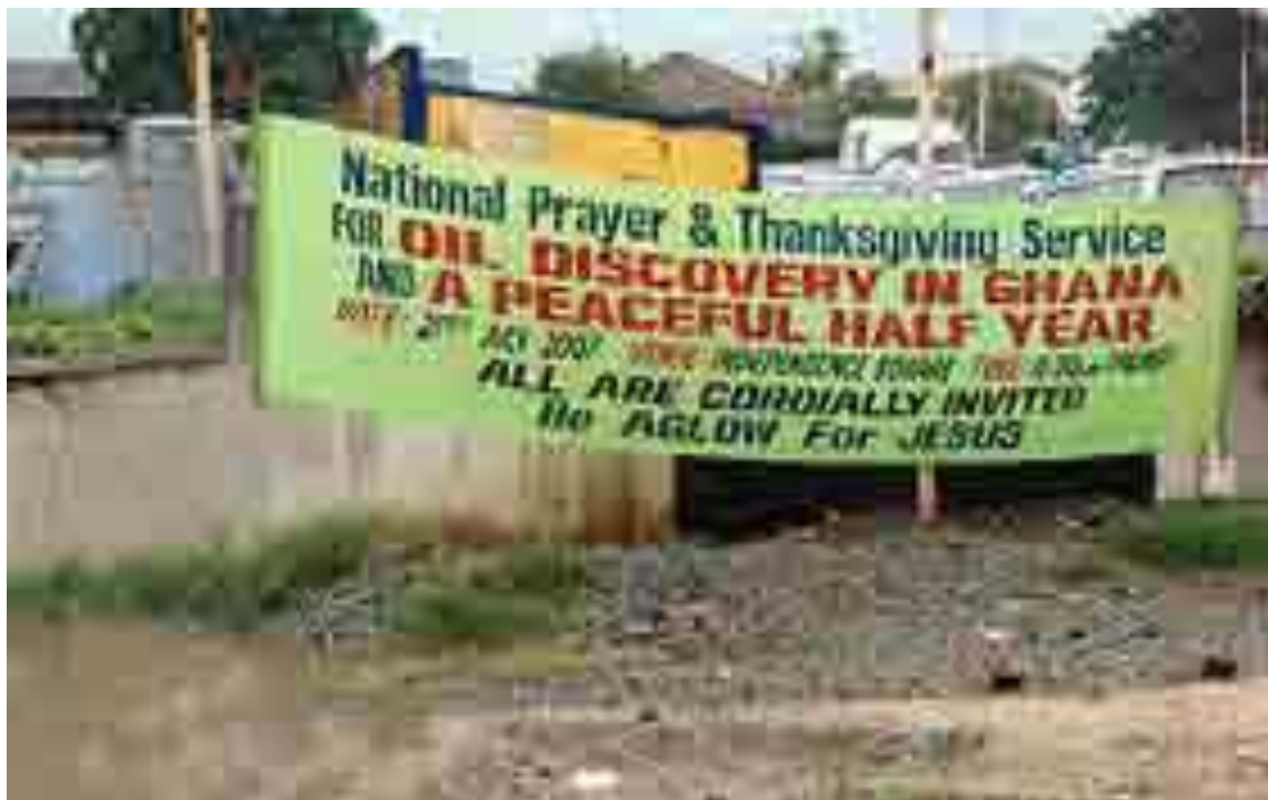
Figure 3: A Banner inscription showing a prayer session for the oil and gas industry in Ghana

Expectations are high among the general Ghanaian populace as to how oil can turn the fortunes of the country around. In religious circles, there have been special prayer and fasting sessions for a successful commercial production of the oil and gas as the figure below shows: