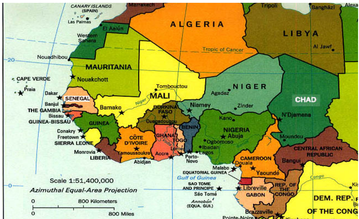
Figur 2. Ghana and Liberia on a West Africa map

http://everythingpossible.files.wordpress.com/2008/03/map-west-africa.jpg (Accessed 20.03.09)