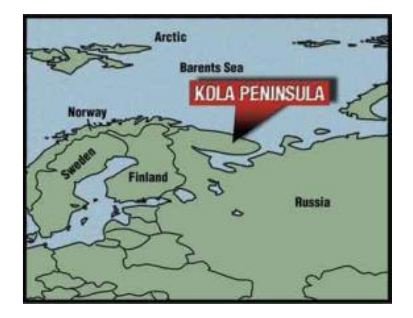
1) Kola Peninsula

During the Cold War, one of Norway's biggest fears was the possibility of atomic war with Russia and invasion of Norwegian territory. The large Soviet military build-up in the North was a source of concern, and although it was not primarily aimed at Norway, it dominated Norwegian security policy. Norway's geographical location made the country extra vulnerable during the Cold War. The country's strategic importance meant that its position and views were of large interest to its allies in the West. With the end of the Cold War and the dissolution of the Soviet Union the risk of invasion of Norwegian territory with subsequent deployment of Russian nuclear weapons became less realistic (Report No. 30 (2004-2005), p.12).