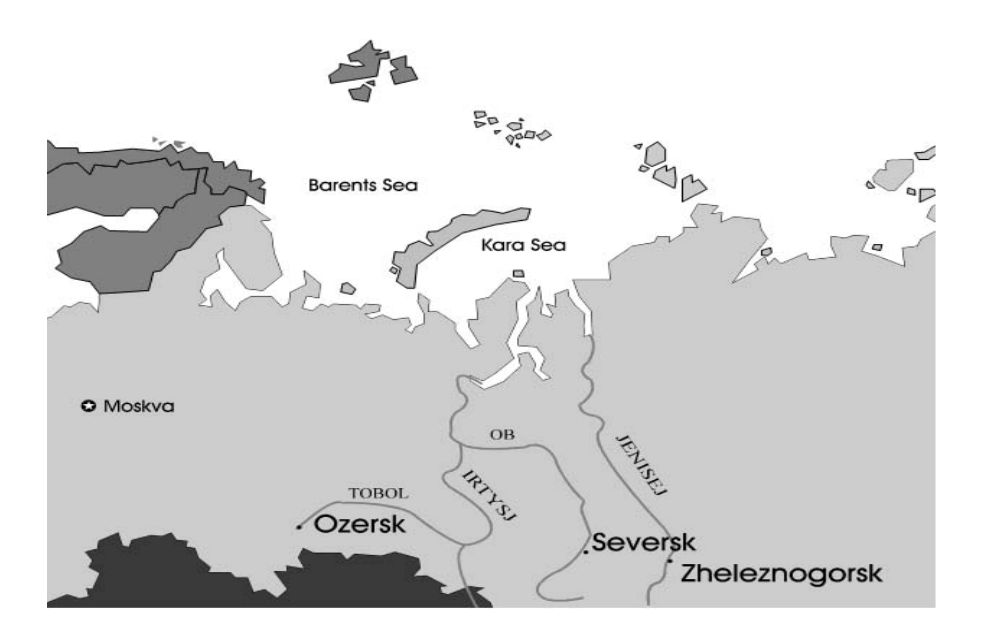
2) Reprocessing in Siberia.