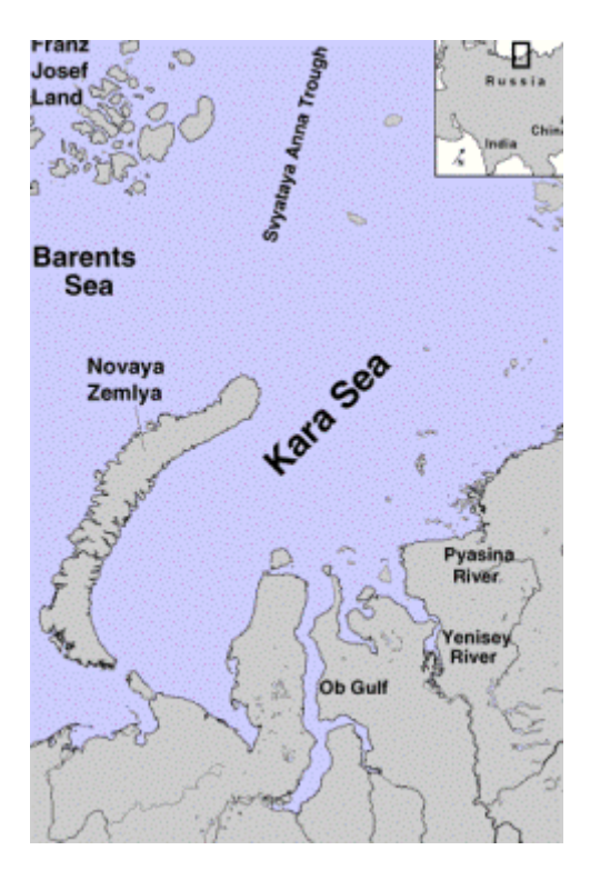
3) Novaya Zemlya.

In northern areas there is also a large quantity of nuclear weapons which have to be destroyed. However, they may cause release of radioactivity if an accident happens during their deconstruction or transportation. Another and probably graver risk is the possibility of theft, sabotage and proliferation of nuclear materials, technology and competence, which can be used for weapons production and "dirty bombs" (Report No. 34 (1993-94), pp. 55-56). This risk is increased by the unstable economic situation in the country, forcing people to act illegally in order to survive, as well as by the rise of international terrorism.