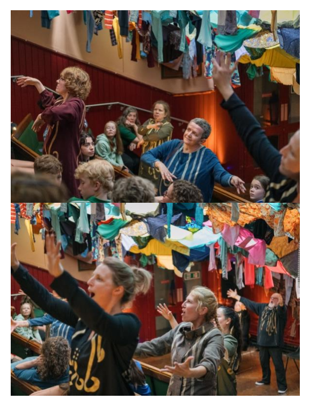
Figure 6–7. Performers from Dublin Theatre of the Deaf and Cork Deaf Community Choir during 'Ode to Joy' at Crawford Art Gallery, Cork (June 2023).