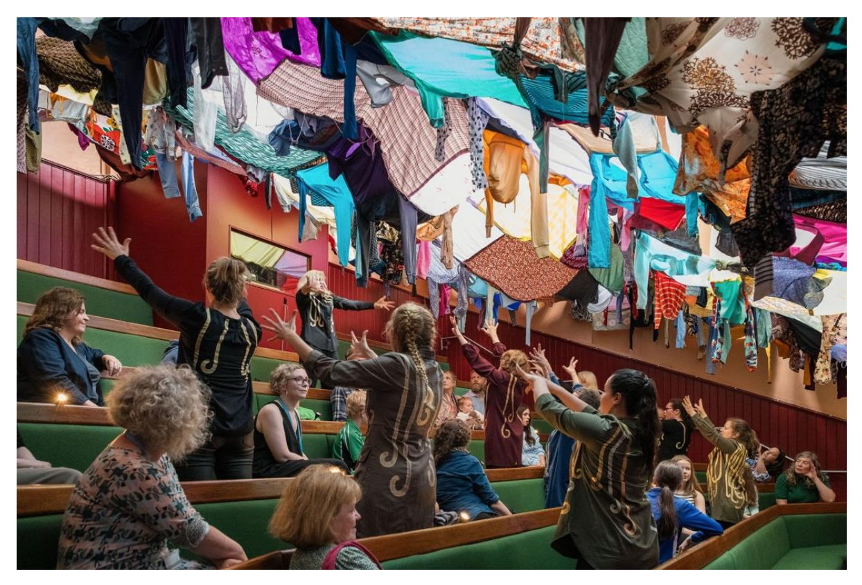
Figure 5. Amanda Coogan [facing forward], Dublin Theatre of the Deaf and Cork Deaf Community Choir perform under the 'starry canopy' in Beethoven's 'Ode to Joy' at Crawford Art Gallery, Cork Midsummer Festival (June 2023).

A shorter version of Freude! Freude! was shown in June 2023 at Cork's Crawford Art Gallery, where Coogan collaborated with the DTD and Cork Deaf Community Choir to perform their interpretation of Beethoven's 'Ode to Joy' ( Figures 5–7 ) to a live audience.