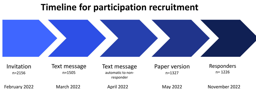
Fig. 1. Flow chart showing timeline for participation recruitment.

A mixed-mode survey design was used to optimize participation rate. The first mailing included study information and an invitation to participate in an online survey. Invited women were informed that a paper version of the questionnaire would be mailed to non-responders after electronic reminders. Non-responders were reminded by text messages containing direct links to the online survey two and four weeks later. Finally, a paper version with a pre-paid envelope was distributed to non-responders one month after the final text message.