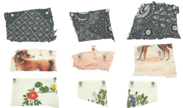
Figure 3. The example of the well-preserved household textile fragments used by Gulbrandsen [20].