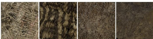
Figure 5. The left and right pair of images were grouped in different clusters, respectively; while the left two patches have thicker threads and relatively low spatial frequency texture, the opposite is true for the right ones.

Let's have a closer look at the clustering results (Figure 5). The fragments in one cluster seem to have thicker threads and lower spatial frequency texture, while in the second cluster, the patches with smaller thread size and higher spatial frequency variation are grouped. This could be an indication that thread thickness is an useful cue to fragment similarity, but as the small patches do not capture global motifs, it can also be misleading if two different artworks were weaved with a similar technique.