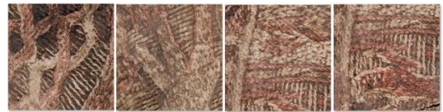
Figure 2. The examples of the patches extracted from the fragments.