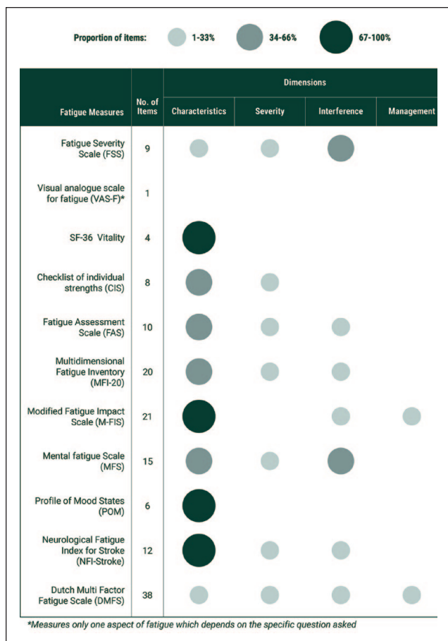
Figure 2. Domains of fatigue covered by outcome measures.

Characteristics = perception of fatigue symptoms, including diurnal patterns; Severity = perceived intensity, including onset speed and recovery time; Interference = degree to which fatigue affects daily life; Management = degree to which coping strategies are used. 9