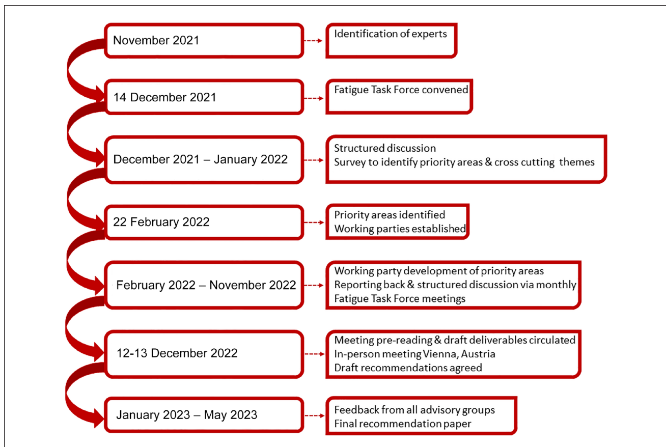
Figure 1. Fatigue task force process.

consulted regularly (Supplemental 1 provides a summary of involvement and feedback).