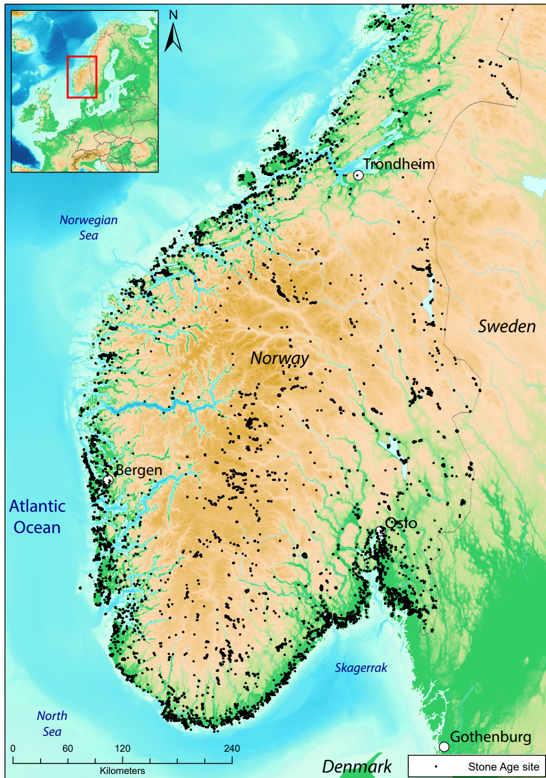
Fig. 1 – A nearly continuous archipelago landscape stretching from Gothenburg to the North Cape, approximately 2500-3000 km by boat along the west coast of the Scandinavian Peninsula. The main map shows only the southern parts of this area ( ; distribution of sites from Askeladden, 2022;).

Fig. 1 – Un paysage d'archipel presque continu s'étend de Göteborg au Cap Nord, soit une distance d'environ 2 500 à 3 000 km en bateau le long de la côte ouest de la péninsule scandinave. La carte principale ne montre que les parties sud de cette zone ( ; distribution des sites d'après Askeladden, 2022 ;).