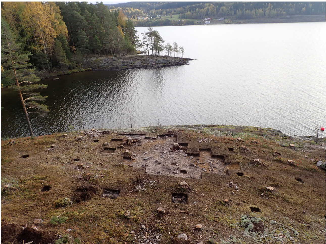
Fig. 3 – The ‘shoreline model’ is based on the notion that settlement sites in general were situated very close to or at the shoreline, both at the coast and by watercourses inland. The photo, showing the excavated area of a small inland lake Stone Age site, Søndre Oddenvika in Stange, Hedmark County, illustrates how these sites were situated relative to the shoreline.

Over the last two decades, the model has remained highly relevant, and is to a large degree supported by