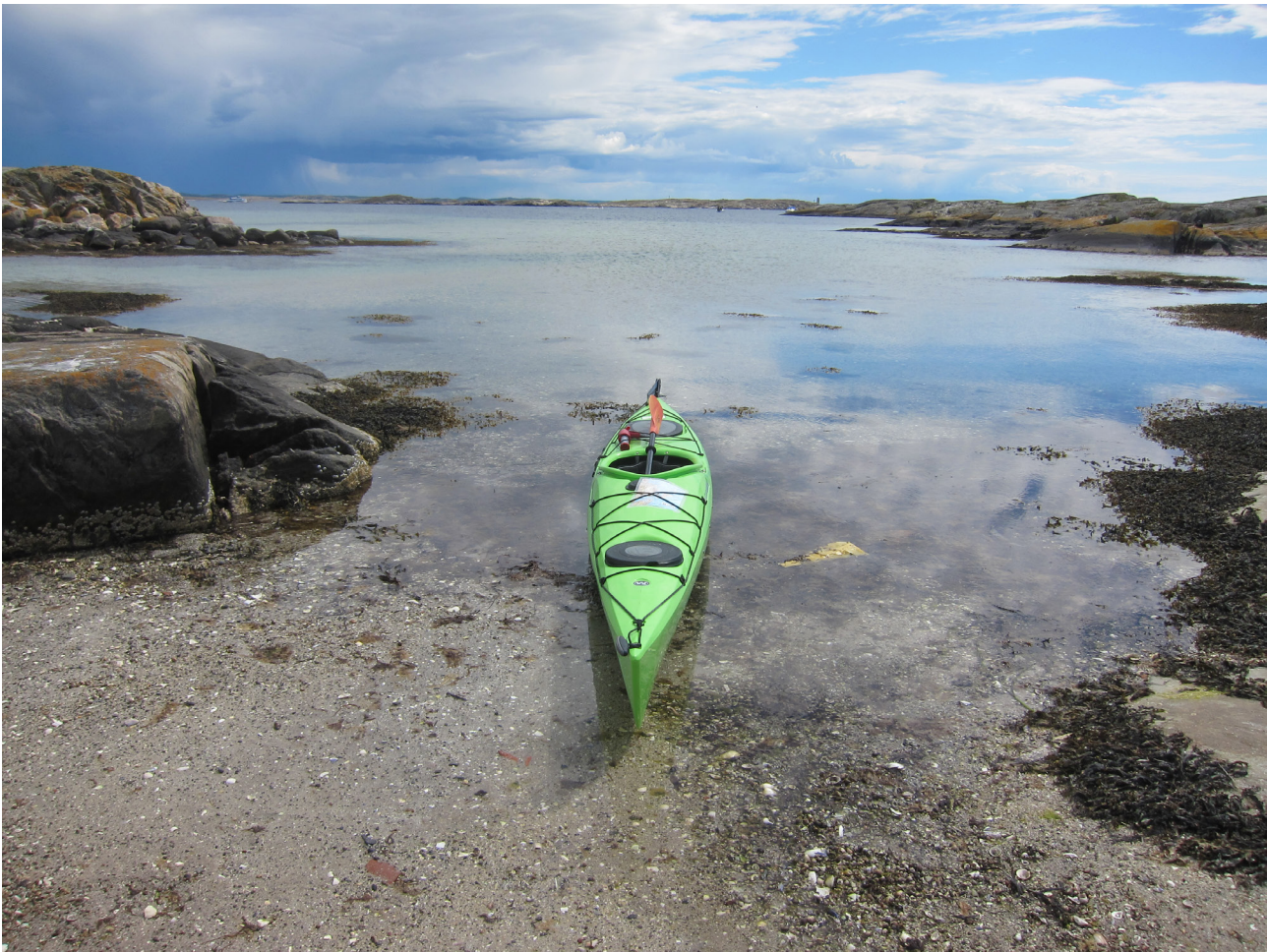
Fig. 2 – Many coastal shores in Norway are easily accessible by boat and well protected from waves and wind.

Fig. 2 – De nombreux rivages norvégiens sont facilement accessibles par bateau, bien protégés des vagues et du vent.