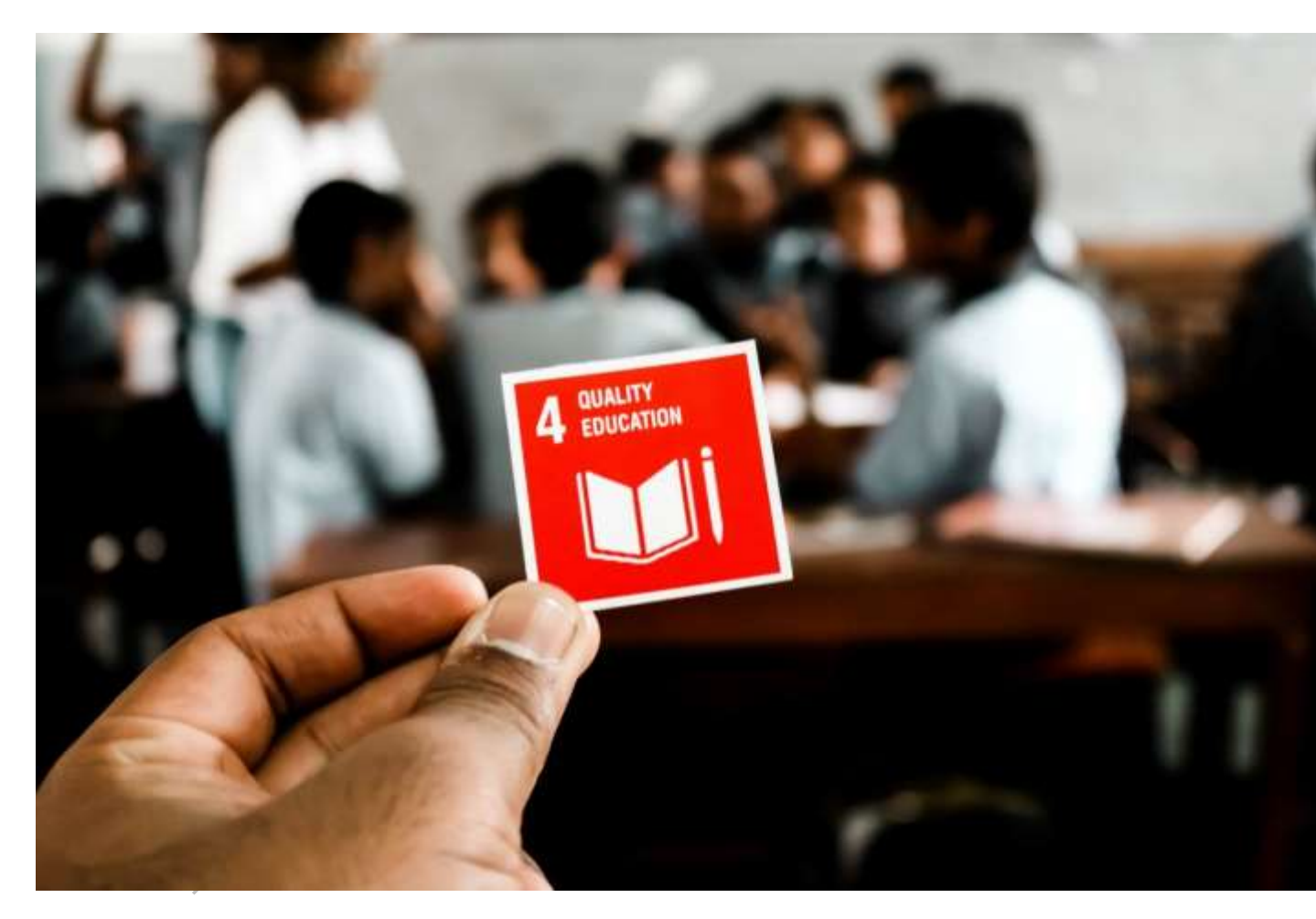
How is sustainable education connected to Sustainable Development Goal 4: Quality Education?

In this part, we present the context, in terms of the dominant discourse on sustainable development (section 2.1), three principles of sustainable development (section 2.2), the EU Green deal and the future of universities (section 2.3), and institutional conditions for achieving the UN's and EU's goals (section 2.4).