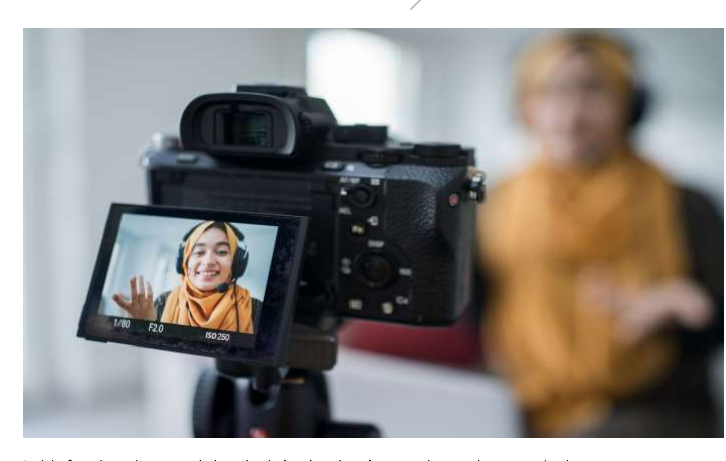
Insight from interviews revealed academics' and students' perspectives on the connection between sustainable education and education for sustainability.

This part presents the voices of academics and students that we have interviewed about the connections between sustainable education and education for sustainability. First, we discuss the interviewees' views that the complexities of defining sustainable education (section 4.1). We then delve into different conceptualisations of sustainable education, from rejecting the term 'sustainability' (section 4.2), via the notion of education for a sustainable world (section 4.3), education to sustain students for their lifetime (section 4.4), connections between sustainable education and education for a sustainable world (section 4.5), ideas of sustainability in practice (section 4.6) towards institutional opportunities and barriers in implementing sustainable education (section 4.7), including opportunities and disadvantages of digitisation.