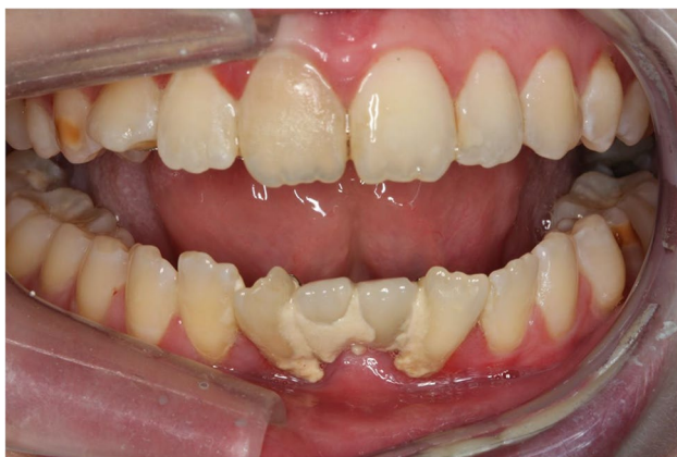
Fig. 3 Photo illustrating maximum mouth opening of 16 mm in a 32-year-old female survivor of MB/CNS-PNET. The participant was treated at the age of 2 1/2 years. Abbreviations: MB medulloblastoma CNS-PNET central nervous system supratentorial primitive neuroectodermal tumor