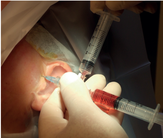
Picture showing arthrocentesis with the push-and-pull technique using Behepan®/salic water.

Ultrasound-guided arthrocentesis (push and pull technique, Alstergren 2003) were performed in general anesthesia in a sterile operation field. Bacteria skin samples from the injection site were taken before and after skin disinfection. Samples were immediately frozen at -80°C for later analyses.