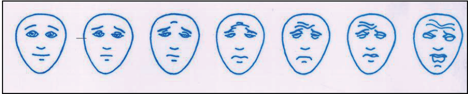
Visual faces pain scale, Bieri D et al. Pain 1990, 41: 139-50.

Joints were randomly selected for either arthrocentesis with glucocorticoid or arthrocentesis alone. Recordings of jaw function and pain, spontaneous and upon palpation, as well as previous treatment, on-going treatment and general medical history were performed at baseline (before intervention) and at two follow-ups (mean, 3 and 8 months). Pain assessments were performed using both VAS (scale, 0-10 cm and number, 0-100) and a visual faces pain scale.